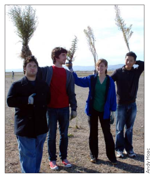
Volunteers at the Alameda Wildlife Refuge enjoying a break.

Located at Lake Merced in San Francisco, the Harding Park Golf Course is not what you might expect to see in a habitat restoration site. Situated under exotic Monterey Cypress trees, the area where Golden Gate Audubon works, along the course's hole 10 at the top bank of East Lake, is dotted with native shrubs. The natives were planted to extend the coastal scrub habitat around Lake Merced, with the goal of attracting not only California Quail but other resident birds. Although managing the non-native