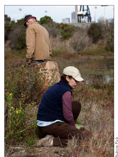
Workday at Pier 94, San Francisco.

Not a typical refuge, the Alameda Wildlife Refuge is located in a corner of the former Alameda Naval Air Station. To reach the refuge (open only on workdays), you must pass through a gate in the chain-link fence and sign in with Friends of the Alameda Wildlife Refuge volunteer Joyce Larrick. Joyce sends you driving over decrepit, unused runways to the worksite. There, another