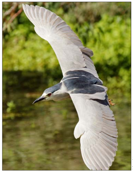
Black-crowned Night-Heron, a year-round resident at Berkeley's Aquatic Park.

The Berkeley Parks, Recreation, and Waterfront Department has initiated changes at the 25-acre Aquatic Park, a productive and popular birding destination. The department will begin a program at the park that includes tree trimming, vegetation removal, and new plantings. The goal is to reduce the accumulation of trash and human waste and the trampling of vegetation caused by people using this part of the park for drug use, sexual activity, and encampments. Under the new plan, smaller shrubs will be planted near the roadways, and larger bushes and trees near the lagoons, with the intention of eliminating most of the