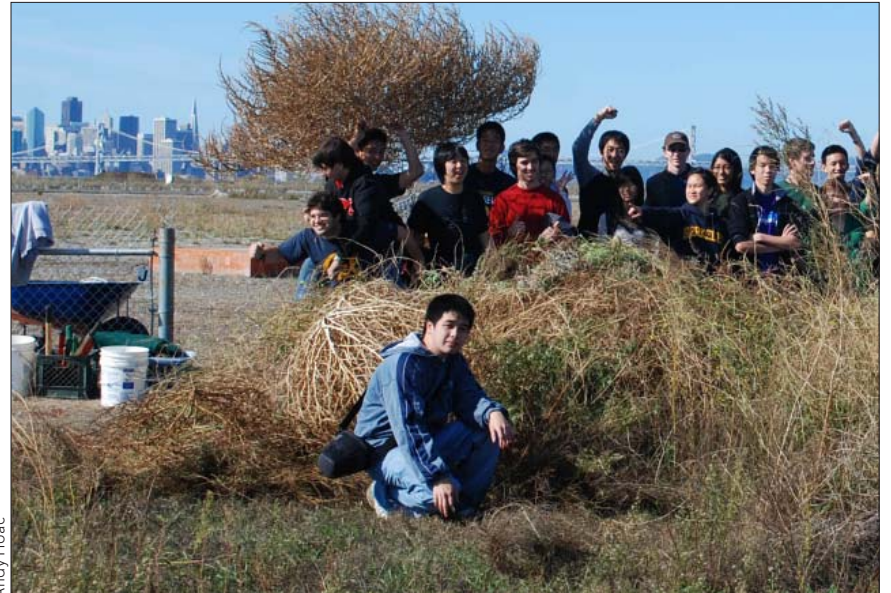
Volunteers at the Alameda Wildlife Refuge.