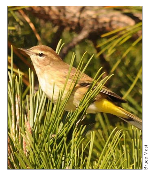
Palm Warbler at D'Anna Yacht Harbor, Oakland.