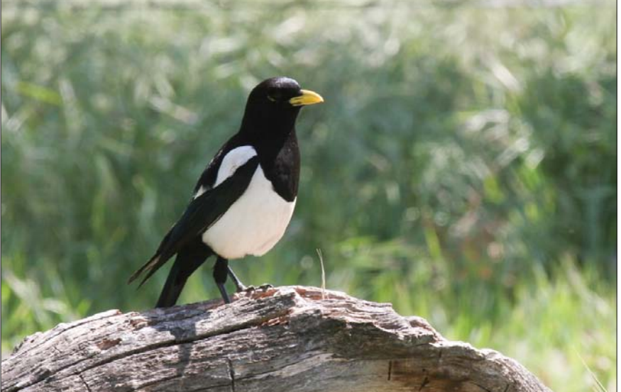
Researchers with Audubon California have determined that the Yellow-billed Magpie could lose as much as 75 percent of its range in the next 100 years due to climate change, possibly driving it to extinction.