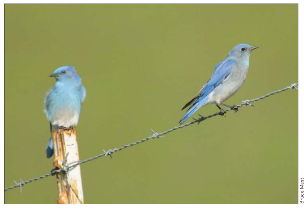
Mountain Bluebirds at Brushy Peak Regional Preserve.