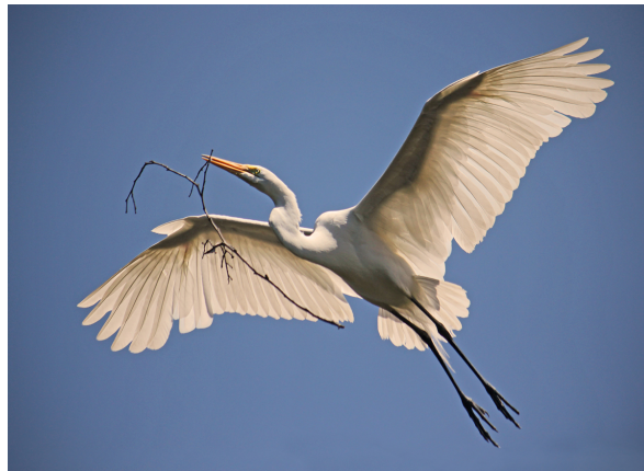
Great Egret

Whether you enjoy hiking, walking, biking, or simply sitting in your backyard... knowing how to identify birds will enrich and deepen your outdoor experiences.