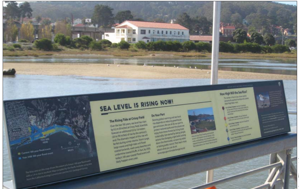
New interpretive signage at Crissy Field, San Francisco.

The Western Snowy Plovers are in their winter habitats in San Francisco at Crissy Field in the Presidio and at Ocean Beach. Take time to visit both sites and see the plovers and other shorebirds along San Francisco Bay and the Pacific Ocean. The Golden Gate National Recreation Area recently installed informational signage at Crissy Field about rising sea levels and