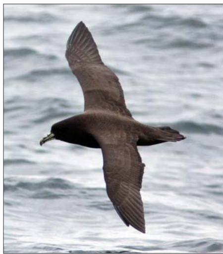
White-chinned Petrel observed on the October 18 pelagic trip off the San Mateo coast.

October raptor migration brought 4 Northern Goshawks to the MRN Headlands and NW SF, Oct. 10–29 (PS, JC, BP, MZ, SB). The Bodega Harbor, SON, American Golden-Plover ( Pluvialis dominica ) remained at Doran Park through the 3rd (RSc, BL; KW, oob). Controversy swirled around a presumed juvenile Long-toed Stint ( Calidris subminuta ), photographed and videoed Oct. 24–27 at Limantour Beach, PRNS, MRN (RSt; mob). Observers who focused on still photos favored Least Sandpiper, while those who studied video or saw the bird live favored stint. On