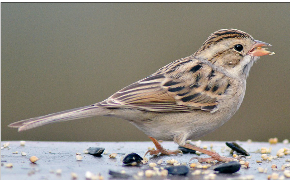
The Oakland CBC's second-ever Clay-colored Sparrow appeared in late November. It was photographed on count day and earned "best bird" honors.

Populations of several species have been on the rise in the count circle. Red-shouldered Hawk, American Crow, Common Raven, and Pygmy Nuthatch come to mind, along with the Johnny-come-lately Wild Turkey, which was not detected until 2002. All these species, except Common Raven, hit all-time highs in 2012. Whether their population increases are due to range