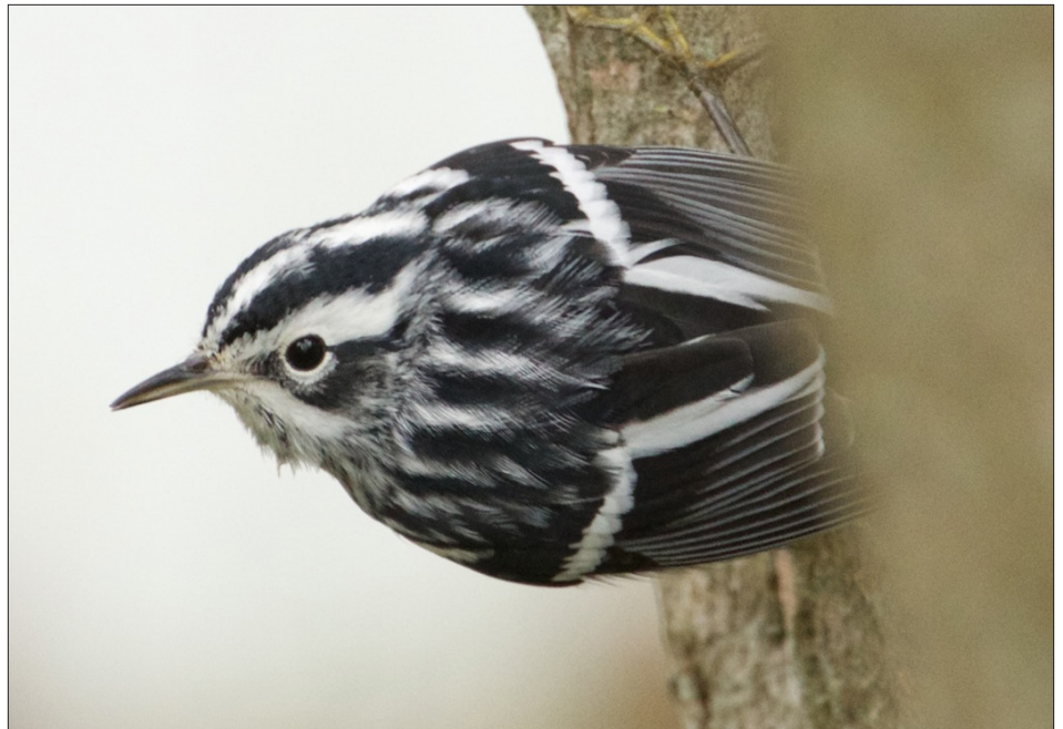
This Black-and-white Warbler along El Cerrito Creek was the first found on the Oakland count since 2005.