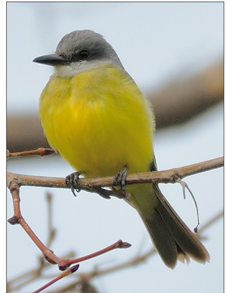
This Tropical Kingbird, the first ever found for the count, was at Garretson Point on December 13. It was photographed the next day, but was missed on count day.

Unexpected, and unusual, species found on count day included a Snow Goose (Berkeley waterfront), a second Ross's Goose (Golden Gate Fields), two Short-eared Owls (Bay Bridge toll plaza and Arrowhead Marsh), six Tree Swallows (Lafayette Reservoir), a Black-and-white Warbler (El Cerrito), four Hermit Warblers (a Berkeley residence, along Skyline Boulevard, and