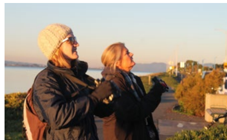
Townsend's Warbler; counting in Emeryville.