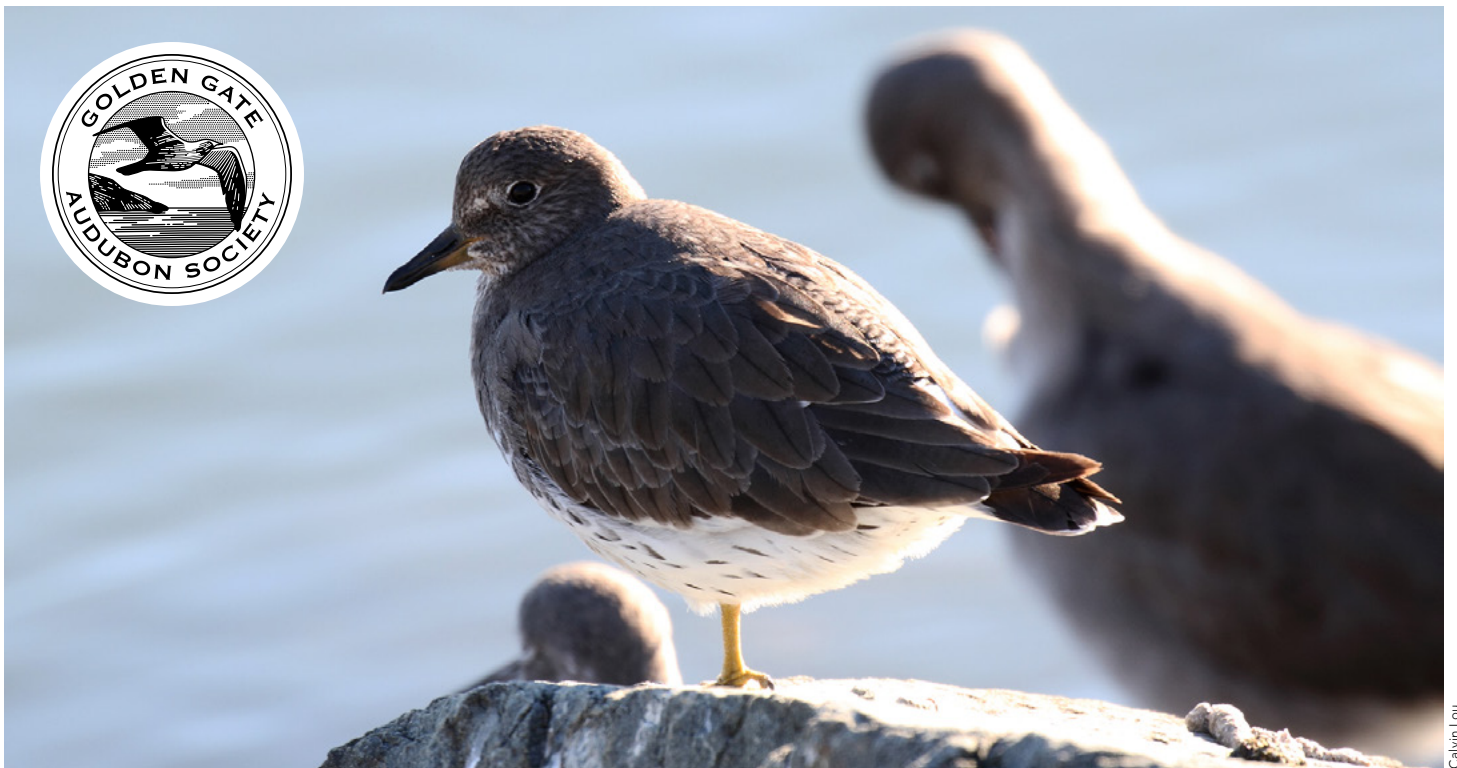
Surfbird seen by Emeryville team.