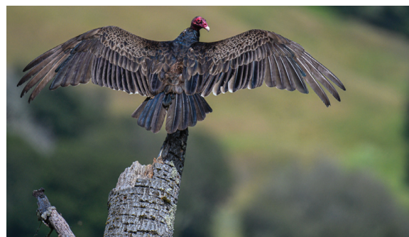
At left, Nuttall's Woodpecker; above, Western Bluebird and Turkey Vulture.