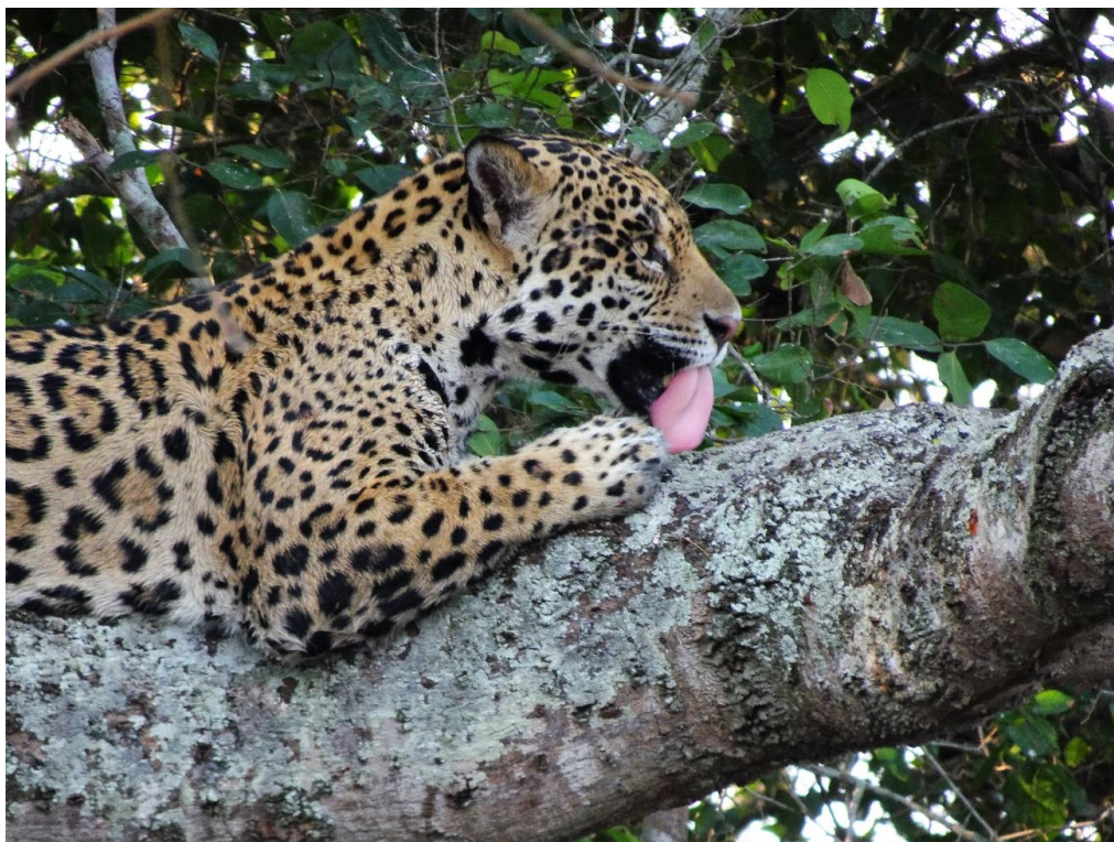
Jaguar is one of our targets on this trip.