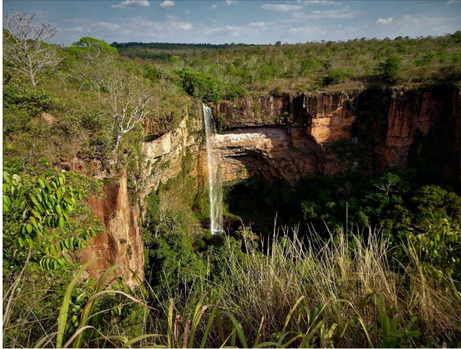
Bridal veil waterfall, Chapada dos Guimarães

After three nights at Pousada do Parque in the Chapada dos Guimarães National Park, we will drive to Poconé at the entrance to the largest wetland in the world, the Pantanal. During our stay in the Pantanal we will visit and stay at different lodges, which are carefully chosen to provide the best birding and wildlife opportunities.