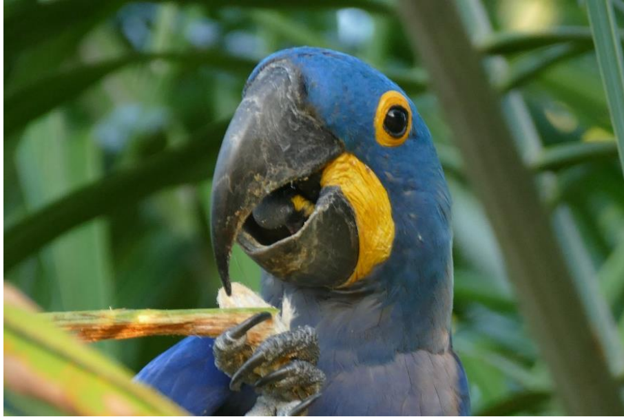
Hyacinth Macaw

Later we will transfer to the Pantanal Mato Grosso Hotel, which is strategically located next to the Pixaim oxbow lake. During our stay at the Pantanal Mato Grosso Hotel we will do boat trips searching for aquatic species such as Amazon, Ringed, Green, Green-and-rufous, and American Pygmy Kingfisher, Agami Heron, Jabiru, and Cocoi Heron . Here we also might see Blue-throated Piping Guan, Golden-collared Macaw, Black-collared Hawk, Sungrebe, and Giant Otter .