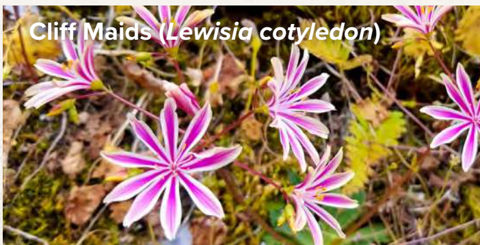
Cliff Maids ( Lewisia cotyledon )