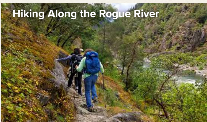
Hiking Along the Rogue River