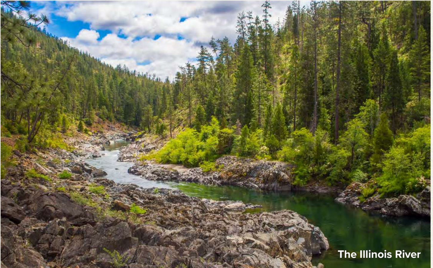
The Illinois River