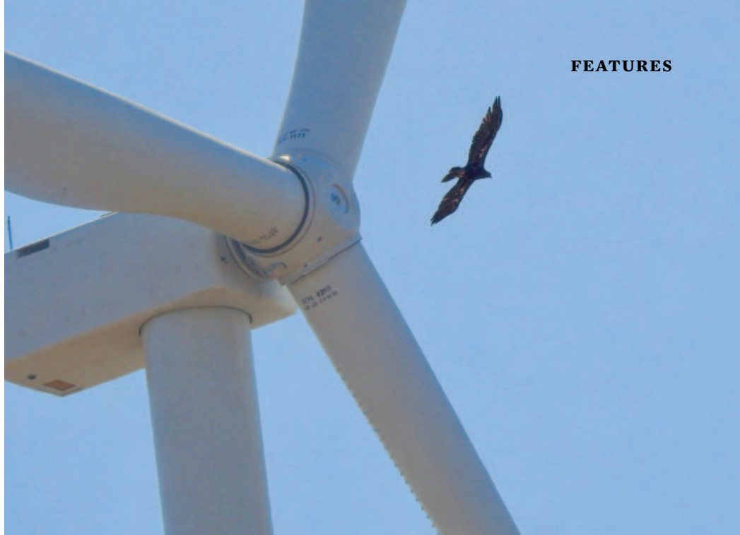
Golden Eagle near an Altamont turbine.

In the wake of the 2010 repowering settlement, Alameda County authorized a Program Environmental Impact Report (PEIR) covering its portion of the Altamont, with the intent to minimize repowering’s toll on wildlife. Four focal raptor species (Golden Eagle, Red-tailed Hawk, Western Burrowing Owl, and American Kestrel) were selected as standards by which biolo-