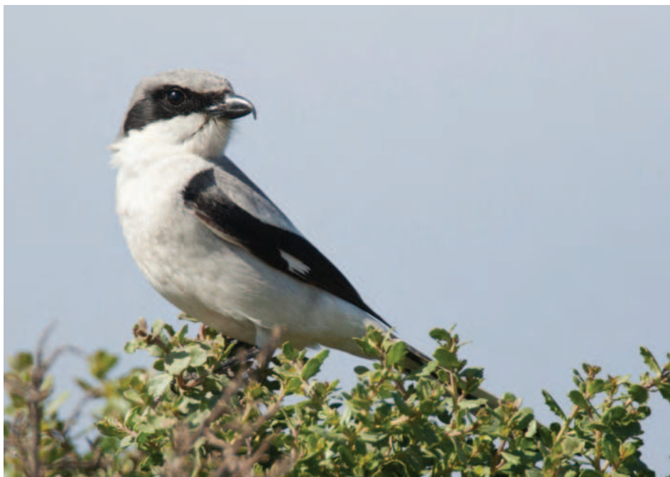
Loggerhead Shrike is among the birds found at Tesla Park.