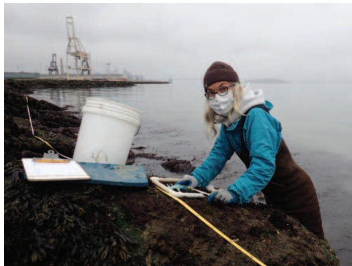
Monitoring oysters and tiles at Pier 94.

Oysters attached themselves to the tiles at a high rate. They were found at a variety of sizes, indicating a healthy balance of younger