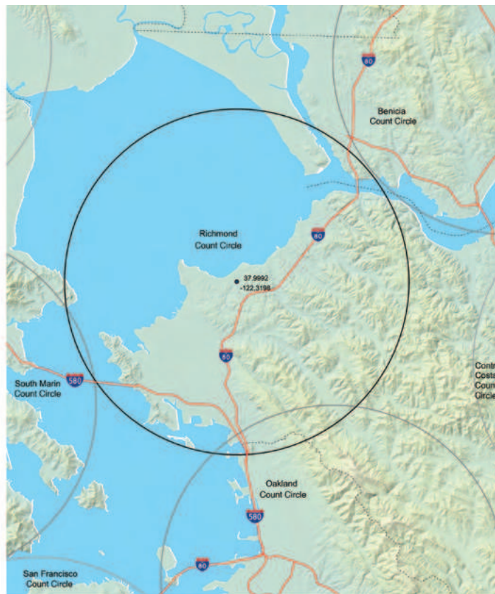
Map of new Richmond count circle and nearby count circles.