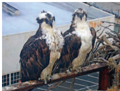
Literal "empty nester" parents Rosie and Richmond in early September.