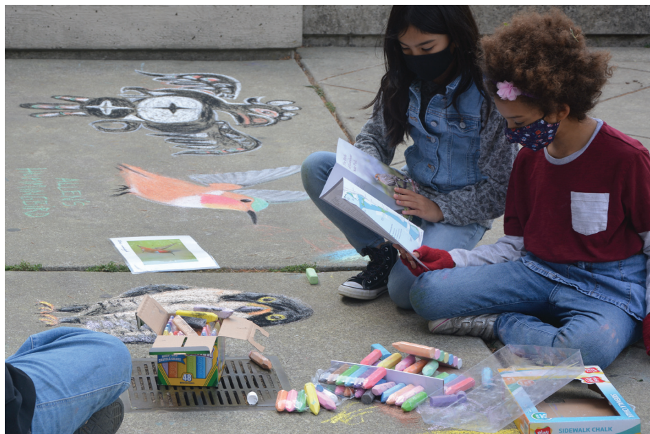
Youth participate in chalk art for the Berkeley Bird Festival.

The Berkeley Bird Festival was made possible by the financial support of the UC Berkeley Chancellor's Community Partnership Fund, and the following partnerships; the UC Botanical Garden at Berkeley, the UC Berkeley Museum of Vertebrate Zoology, Cal Falcons, David Brower Center, Bay Nature, and Berkeleyside.