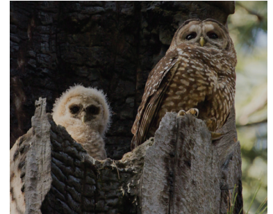
California spotted owl in burned snag nest.