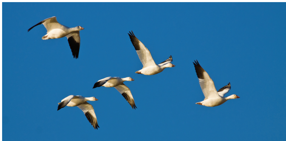
Snow and Ross's Geese.