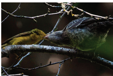
Cowbirds and Wilson’s Warbler.