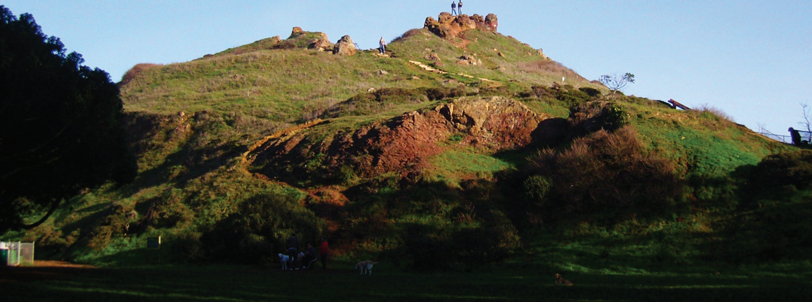
Corona Heights Park in San Francisco.