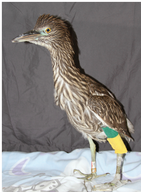
Black-crowned Night Heron.

Interested in getting involved? The Oakland Zoo is looking for volunteers to assist the Heron and Egret Rescue project staff for various shifts throughout the day. Contact ozvolserv@oaklandzoo.org for more information.