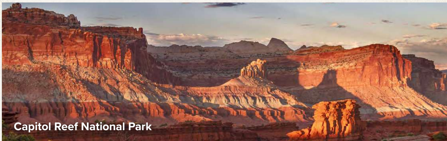
Capitol Reef National Park

look at the fascinating Native American petroglyphs of “Newspaper Rock.”