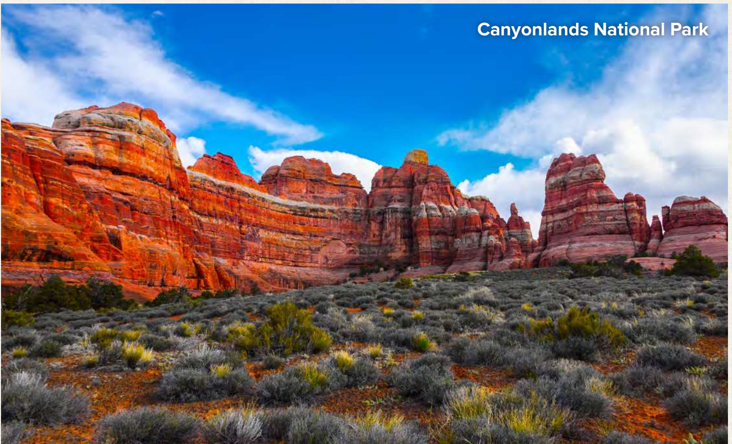
Canyonlands National Park

To register for this tour, contact the GGAS Travel Desk at travelprogram@goldengateaudubon.org