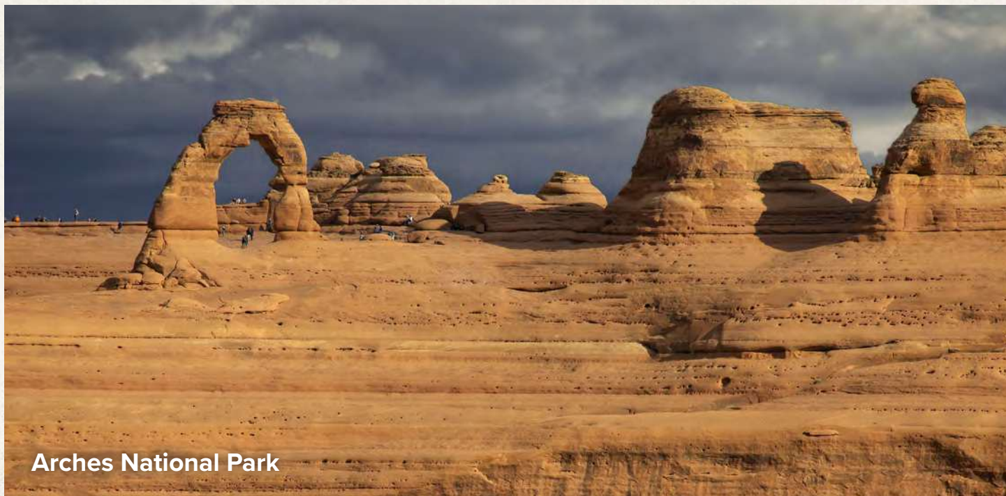
Arches National Park

We'll get an early start today, in an effort to be among the first people entering Arches National Park . We plan to be in the park around sunrise, to enjoy the morning light on the gorgeous scenery. Iconic arches we expect to see today include Delicate Arch ,