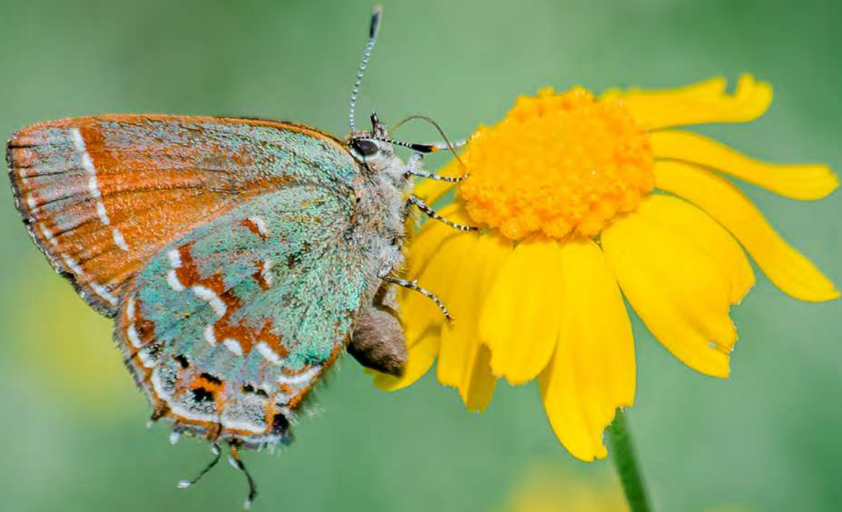
Juniper Hairstreak butterfly