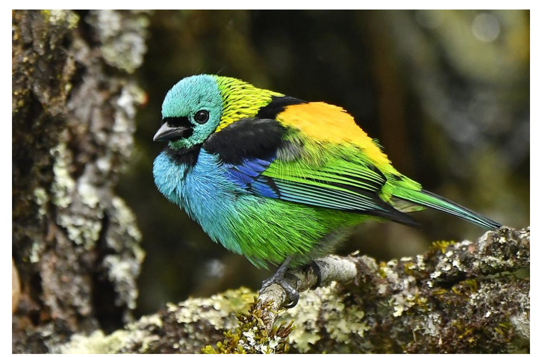
Green-headed Tanager is one of the best birds at Iguazu