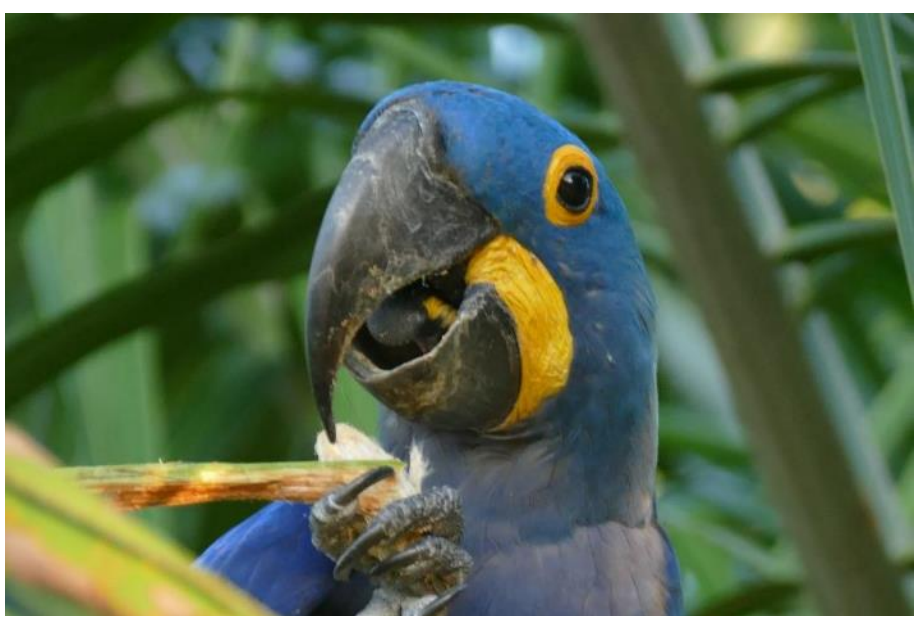
Hyacinth Macaw

Before dusk, we'll try for the elusive Zigzag Heron. The gallery forest behind the hotel is good for Blue-crowned Trogon, Buff-throated Woodcreeper, Stripe-necked Tody-Tyrant, White-lored Spinetail, Rusty-backed Spinetail, Mato Grosso Antbird, Black-backed Water Tyrant, and Helmeted Manakin. The grassland around the hotel is good also for Chotoy Spinetail, Long-tailed Ground-Dove, Picui Ground-Dove, Scaled Dove, Red-crested Cardinal, Yellow-billed Cardinal, Chaco Chachalaca, and, with luck, Great Potoo roosting at daytime.