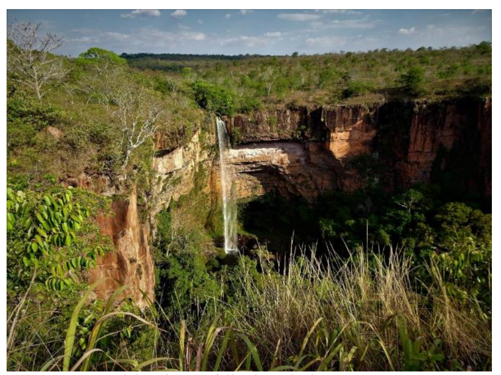
Bridal Veil Waterfall, Chapada dos Guimarães

The birding outside the park includes good targets such as White-rumped Tanager, White-banded Tanager, Collared Crescentchest, Pavonine Cuckoo, Amazonian Motmot, Sharp-tailed Streamcreeper, Brown Jacamar, White-eared Puffbird, and Spot-backed Puffbird. We might also have a chance to see the endemic Crested Black Tyrant, and we'll admire the famous Cachoeira Véu de Noiva (Bridal Veil Waterfall). We will spend four days here in this amazing landscape. The lodge is a great place to relax during the heat of the day.