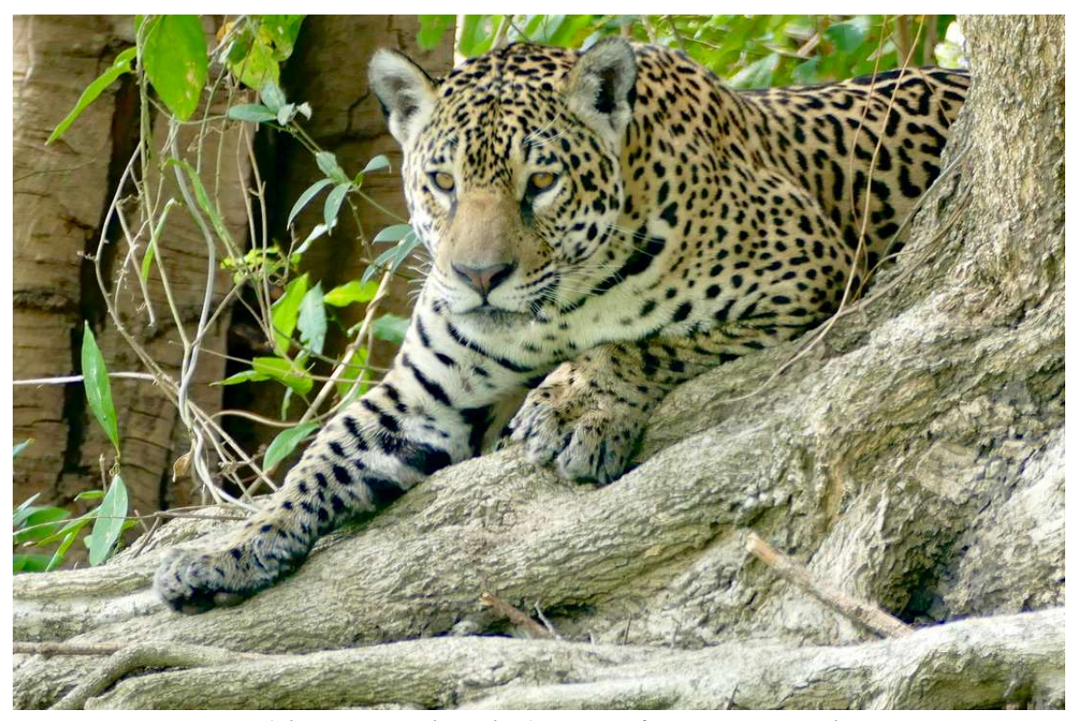
Jaguar is one of our targets on this trip

Our 16-day Iguazú Falls, Pantanal and Chapada dos Guimarães tour is designed to provide our guests with the most incredible birding and wildlife watching experience in this fabulous part of the planet. Iguazú Falls not only provides spectacular scenery, but excellent Atlantic Forest birding. The world's largest wetland, the Pantanal, provides the best opportunity on the planet for Jaguar as well as other charismatic mammals, and of course hosts a great many mouth-watering birds.