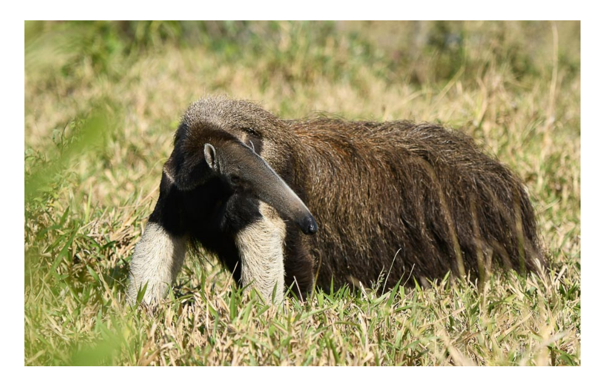
Giant Anteater is one possible to find at Piuval Lodge