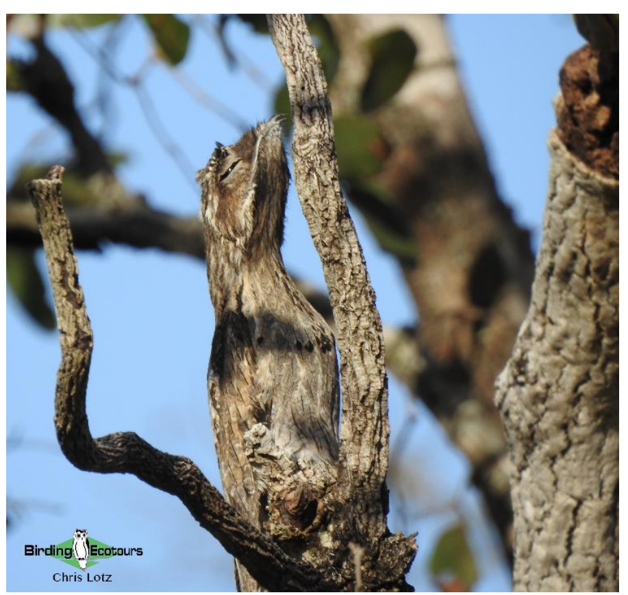
A branch-like Common Potoo