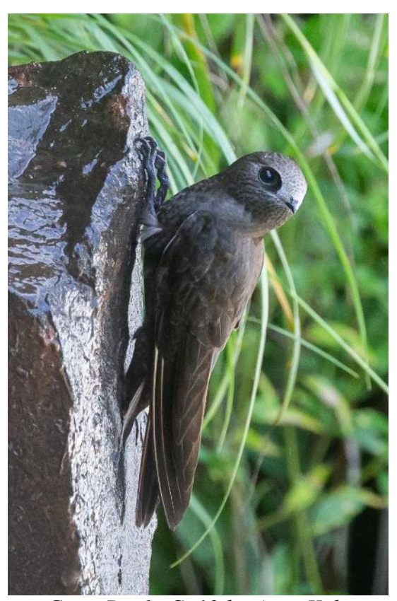
Great Dusky Swift