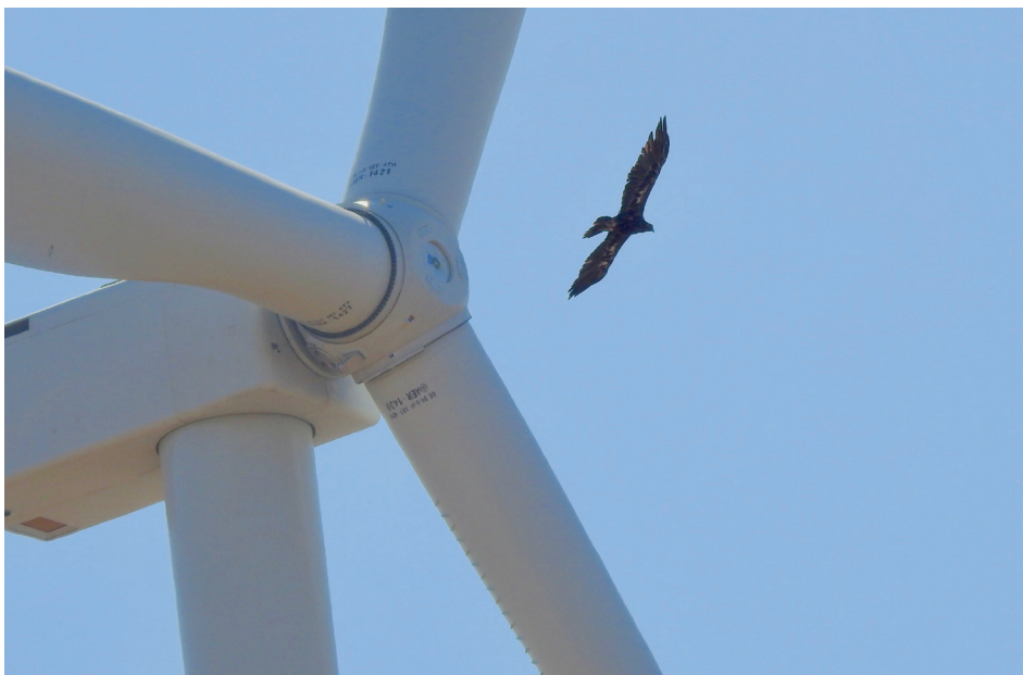
Golden Eagle at Altamont.