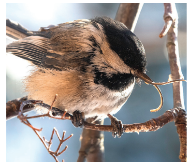
Black-capped Chickadee with AKD.