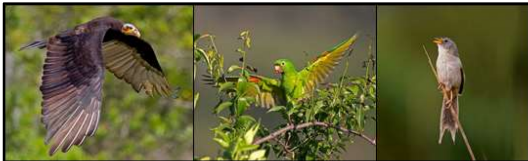
Lesser Yellow-headed Vulture, White-eyed Parakeet, and Lesser Grass-Finch.

Some special birds for days 8 and 9: American Kestrel, Black Vulture, Black-And-White Monjita, Chestnut Seedeater, Diademed Tanager, Dusky-Legged Guan, Green-Winged Saltator, Lesser Grass-Finch, Lesser Yellow-Headed Vulture, Mottled Piculet, Red-Winged Tinamou, Saffron-Cowled Blackbird, Scissor-Tailed Nightjar, Sharp-Tailed Streamcreeper, Squirrel Cuckoo, Straight-Billed Reedhaunter, Tropical Parula, Turkey Vulture, White-Eyed Parakeet, White-Necked Thrush.