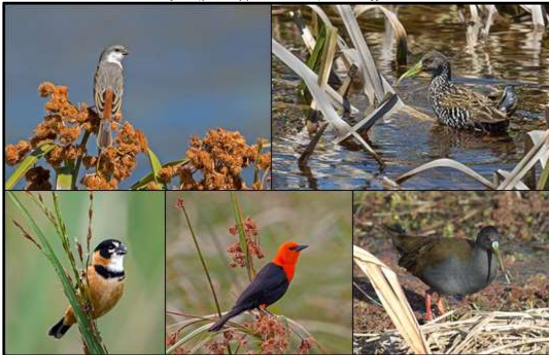
Top: Marsh Seedeater and Spotted Rail (pohleyphoto.com). Bottom: Rusty-collared Seedeater, Scarlet-headed Blackbird (pohleyphoto.com), and Plumbeous Rail.