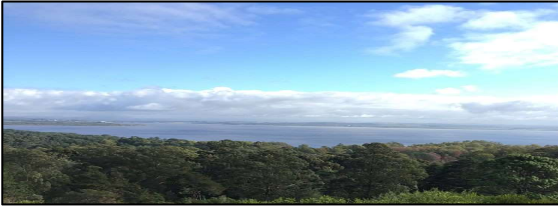
Panoramic view of Laguna del Sauce.