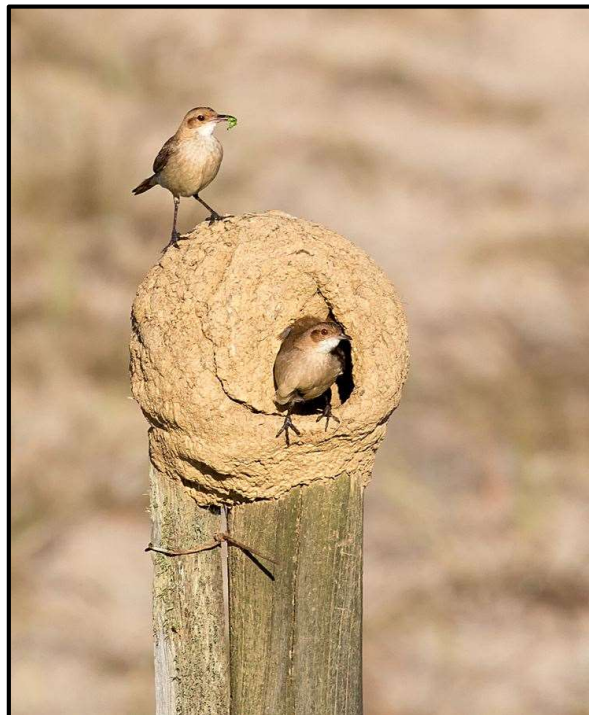
Rufous Hornero in nest.

Uruguay is a small country in Southern South America. It is approximately 600 km long both from north to south and from east to west. In spite of this tiny territory, many different environments can be found across the land: the Pampas, the Atlantic Forest, savannas, wetlands, ocean coasts, countless water courses, grasslands, ravines, several hill ranges, palm tree forests, and many others. This richness of landscapes results in a great diversity of bird species that can be seen easily, in a short time, and in short distances. The territory is also an important feeding and breeding destination for many migrant species that come in summer and winter, from the north and south of the continent. Furthermore, Uruguay is underexplored by science; biologists are still finding new species of flora and fauna and dozens of new bird species have been recorded just in the last few years.