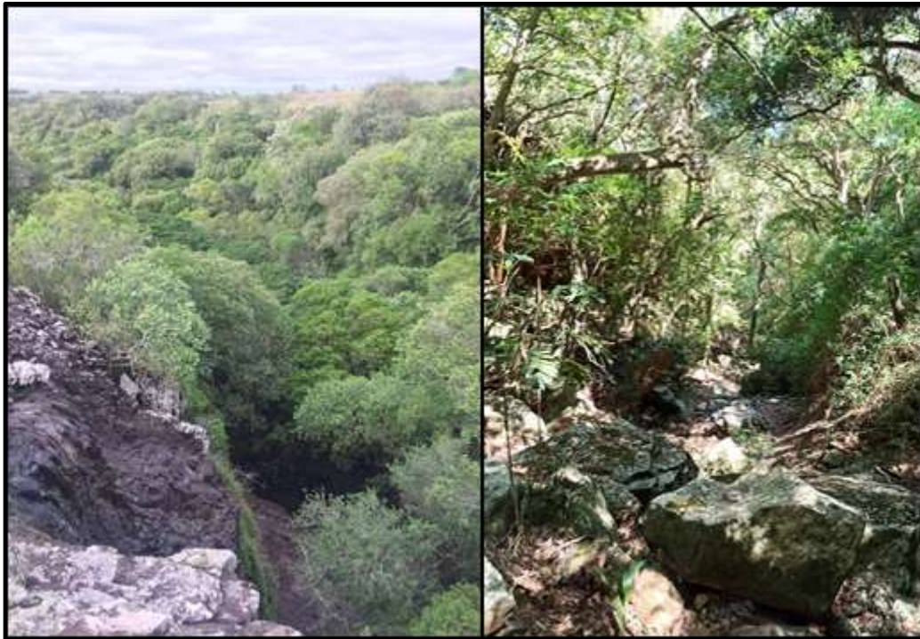
Ravine seen from above and within.