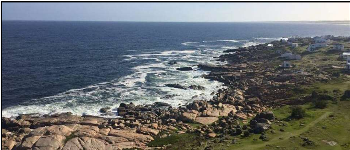
Rocky coasts of the Southwest Atlantic Ocean.