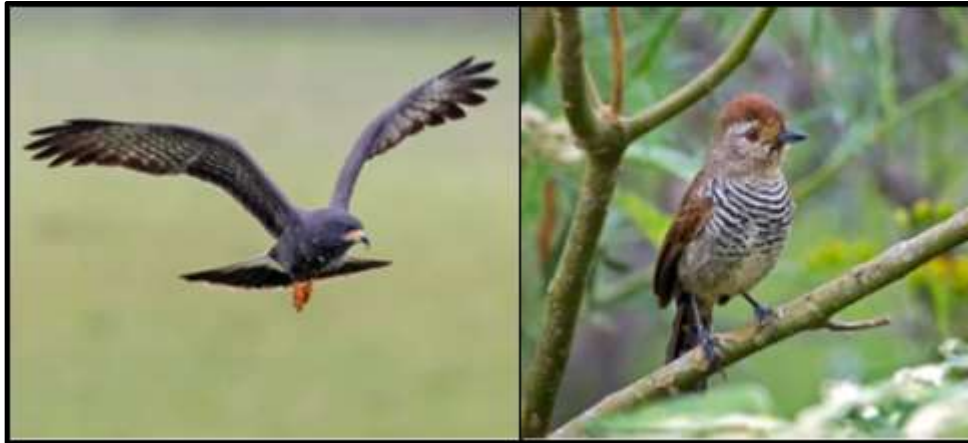
Snail Kite and Rufous-capped Antshrike.