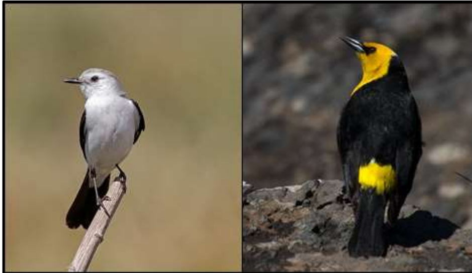
Black-and-white Monjita and Saffron-cowled Blackbird.