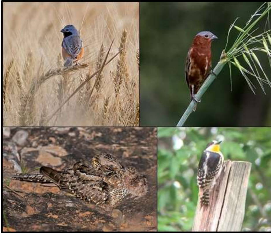
Top: Dark-throated Seedeater and Chestnut Seedeater. Bottom: Scissor-tailed Nightjar and White-fronted Woodpecker.