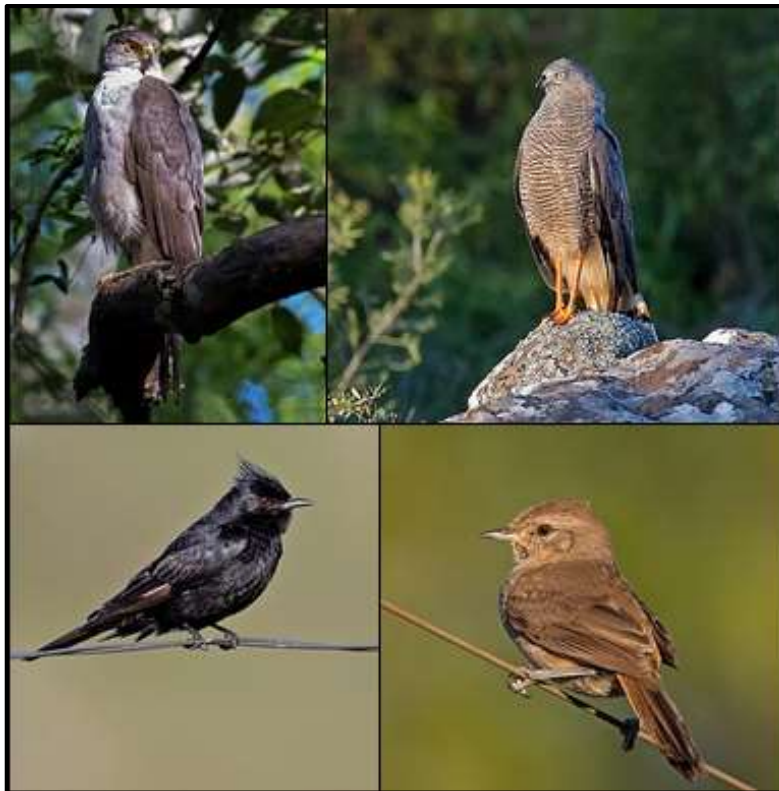
Top: Bicolor Hawk and Crane Hawk. Bottom: Crested Black-Tyrant and Short-billed Canastero.

Some special birds for days 5 to 7: Bicolored Hawk, Blue-Tufted Starthroat, Buff-Necked Ibis, Chestnut Seedeater, Chestnut-Backed Tanager, Cliff Flycatcher, Common Potoo, Crane Hawk, Crested Black-Tyrant, Fawn-Breasted Tanager, Golden-Winged Cacique, Great Pampa-Finch, Greater Rhea, Green-Backed Becard, Green-Winged Saltator, Long-Tailed Reed Finch, Long-Tufted Screech Owl., Maguari Stork, Olivaceous Elaenia, Olivaceous Elaenia, Orange-Breasted Thornbird, Plumbeous Ibis, Red-Crested Finch, Red-Legged Seriema, Scissor-Tailed Nightjar, Short-Billed Canastero, Ultramarine Grosbeak, Wedge-Tailed Grass Finch, White-Eyed Parakeet, Yellow-Rumped Marshbird.