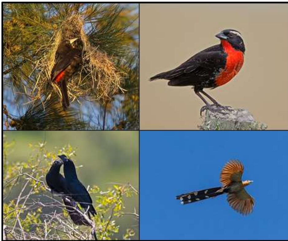
Top: Red-rumped Caique and White-browed Meadowlark. Bottom: Greater Ani and Squirrel Cuckoo.

Target birds: Black-collared Hawk, Brown-crested Flycatcher, Checkered Woodpecker, Cream-backed Woodpecker, Dark-billed Cuckoo, Diademed Tanager, Fulvous-crowned Tody-Tyrant, Fuscous Flycatcher, Golden-billed Saltator, Golden-rumped Euphonia, Grayish Saltator, Greater Ani, Greater Thornbird, Large Elaenia, Lesser Yellow-headed Vulture, Little Nightjar, Pearly-vented Tody-Tyrant, Purple-throated Euphonia, Red-rumped Cacique, Rufous Casiornis, Short-crested Flycatcher, Smooth-billed Ani, Squirrel Cuckoo, White-browed Meadowlark, Yellow-billed Cardinal.