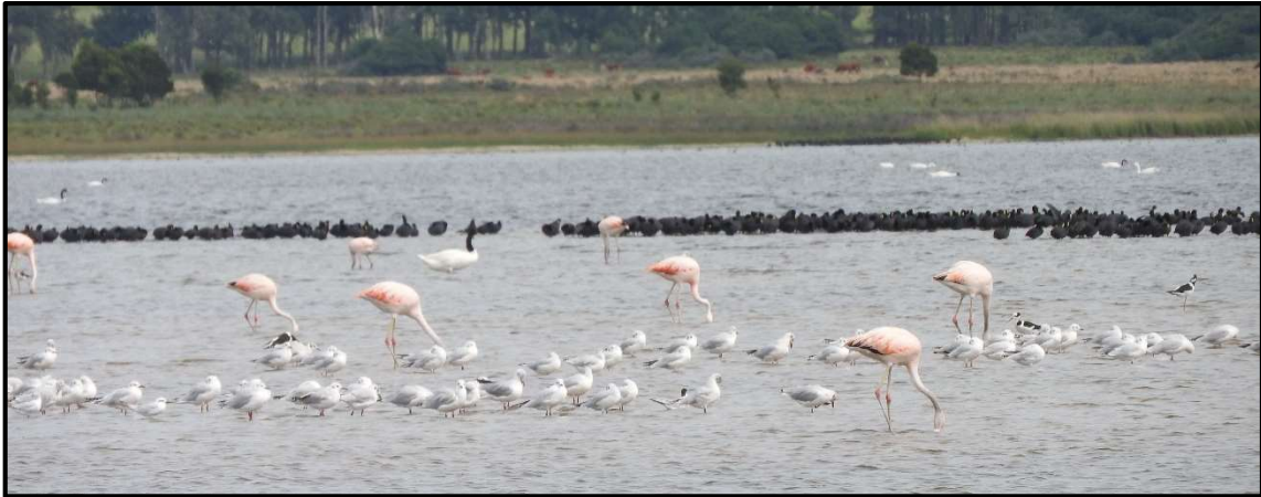
Chilean Flamingos and other birds at Laguna de Rocha Protected Area.