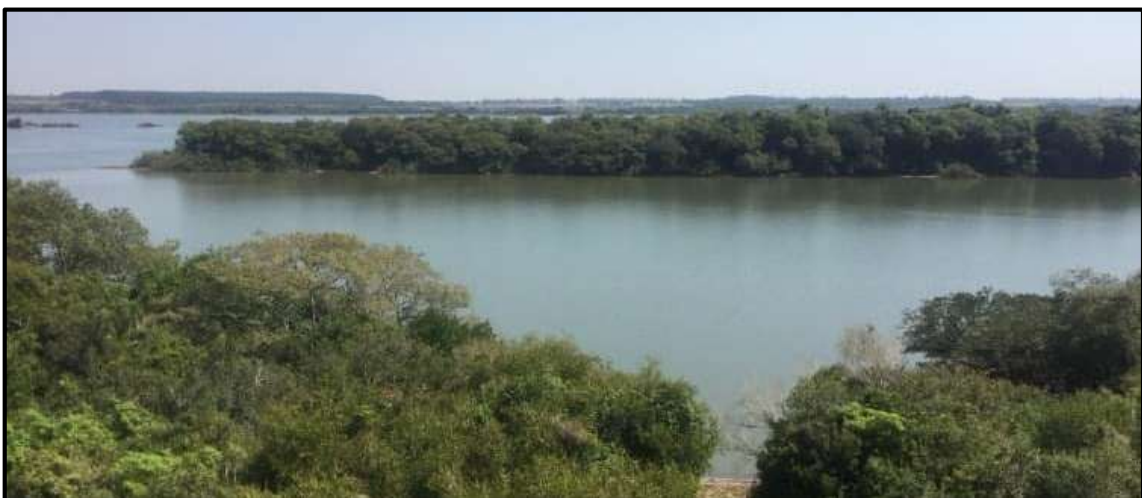
Riparian forest on the shores of the Uruguay river.