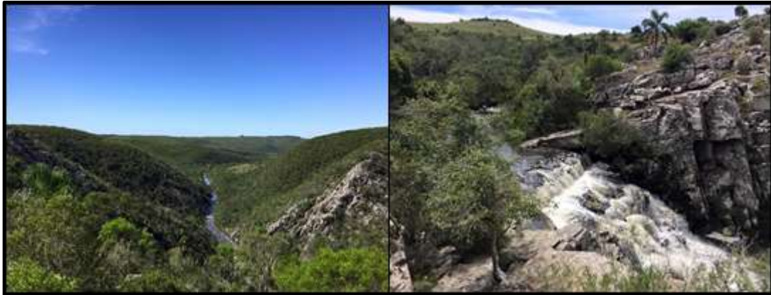
IBA – Quebrada de los Cuervos and surroundings.