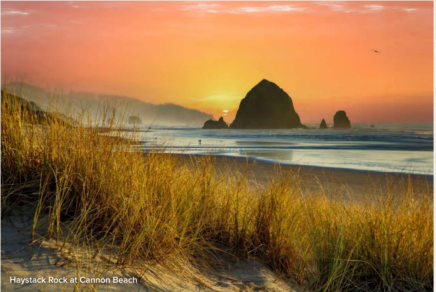
Haystack Rock at Cannon Beach

Once in Portland, we'll make an airport drop-off for those of you heading directly home. For anyone staying in Portland to extend their personal travels, we will offer a drop-off downtown. It's time for farewells as our wonderful trip comes to a close.