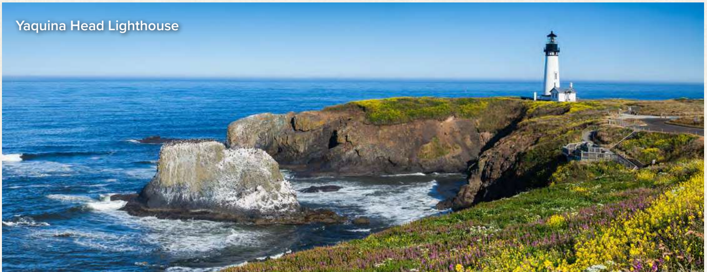
Yaquina Head Lighthouse

Lodging: The Embarcadero Resort, Newport