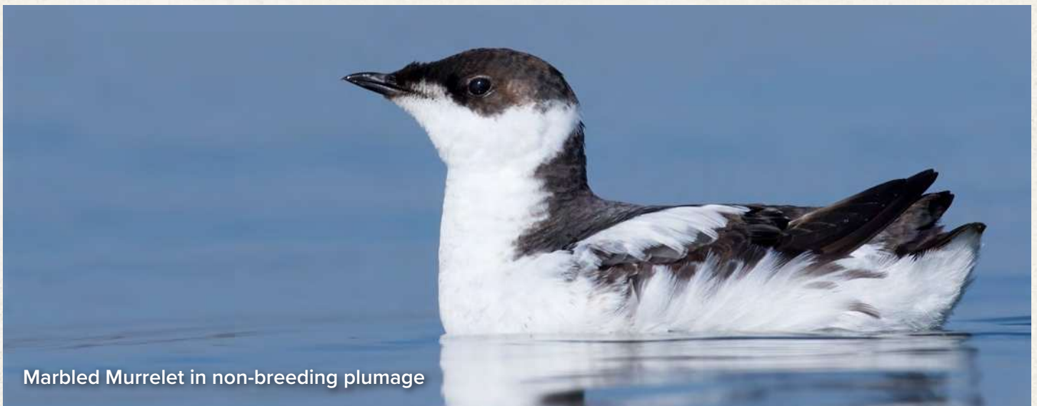
Marbled Murrelet in non-breeding plumage

On every Wild Latitudes tour, we aim to make a positive conservation impact wherever we travel. We utilize the services of local guides and stay in environmentally-sensitive, locally-owned lodges. On every trip, we make a donation to a local conservation effort that works to protect native species or ecosystems. When you travel with Wild Latitudes, you’re helping to protect the wild regions you visit and the amazing species that call them home.