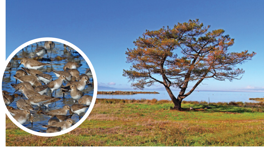
Dotson Marsh in Richmond; (inset) Western Sandpipers at Dotson Marsh.