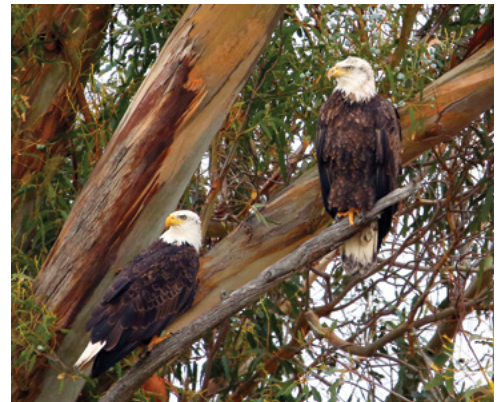
(Left to right) Ridgway's Rails; Shoreline cleanup at Meeker Slough in Richmond; Bald Eagles nesting at Corica Park Golf Course.