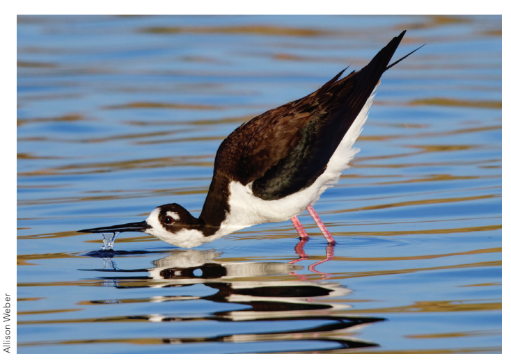
Black Necked Stilt at Coyote Point Marina.