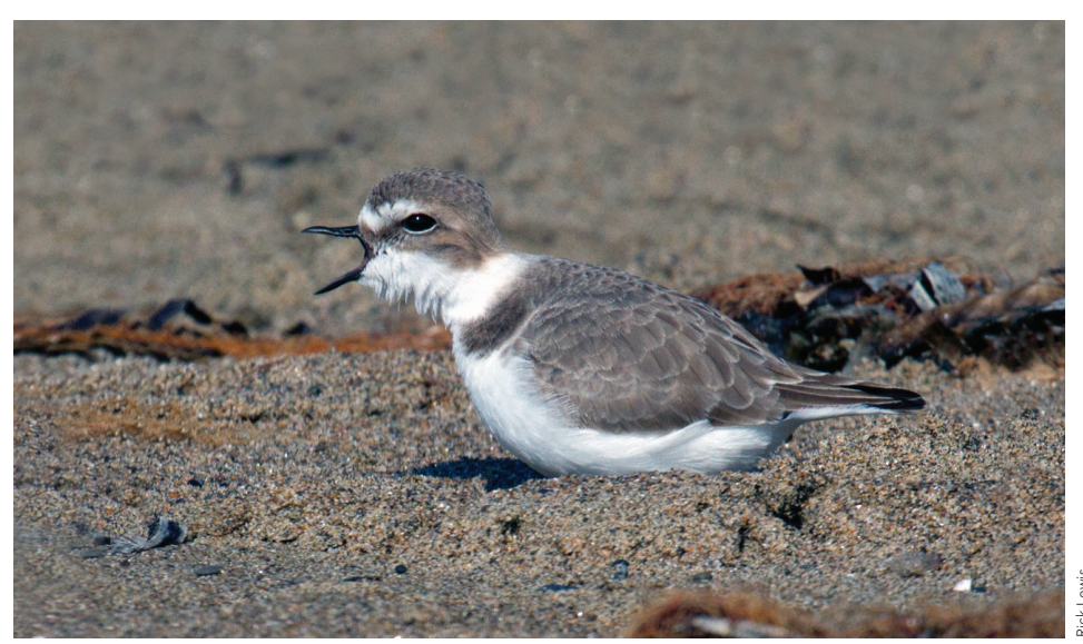
Western Snowy Plover.