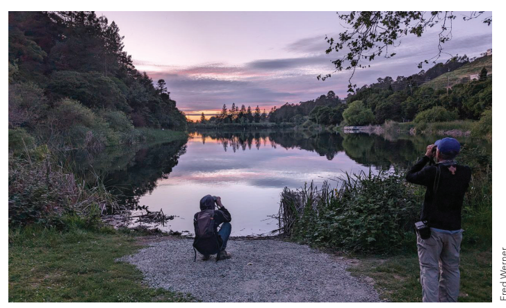
Tactical Shrike Force at Lake Temescal.

Chasing Safety and Fulfillment. Caught up in all of the excitement of bird sightings, participants can easily forget to be safe—and