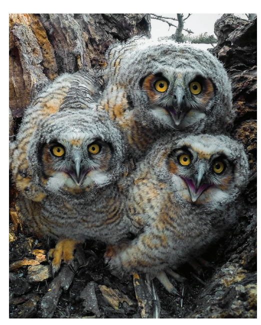
Great Horned Owlets in Nest

Most Enigmatic Birds" is a New York Times bestseller. Her previous books include "The Genius of Birds" (2016) and "The Bird Way" (2020).