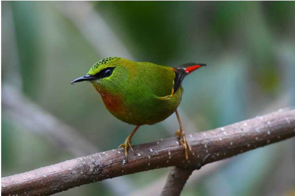
Fire-tailed Myzornis by Chubzang Tangbi

Birds, Mammals and Flowers of the Himalayan Kingdom of Bhutan For the Golden Gate Bird Alliance with Langur Eco Travels