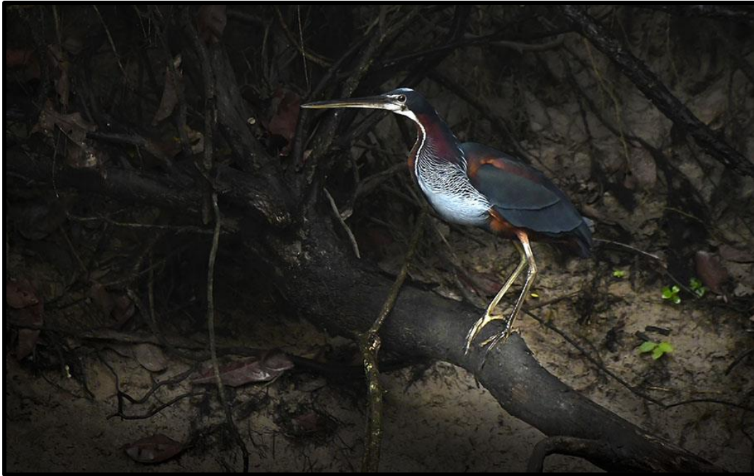
The elusive Agami Heron may be seen in the Pantanal.