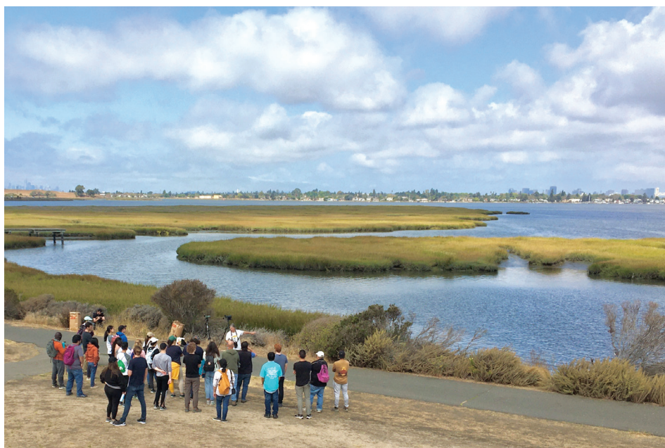
Maureen Lahiff giving a bird talk to group in front of Arrowhead Marsh.

Decades of advocacy to protect tidal marsh in San Leandro Bay culminated in 1971, when GGBA secured Arrowhead Marsh as a refuge for the endangered Ridgway's Rail. Four years later, the Port of Oakland transferred Arrowhead and surrounding marshland to the Park District. In 1986, GGBA and others sued the Port to stop the filling of adjacent wetlands—leading to the