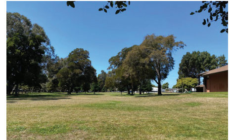
From left: Ruby-crowned Kinglet ; Booker T. Anderson Jr. Park.