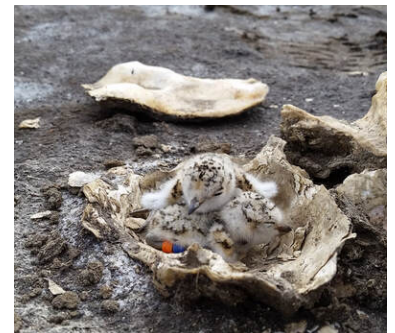
Snowy Plover at salt pond.