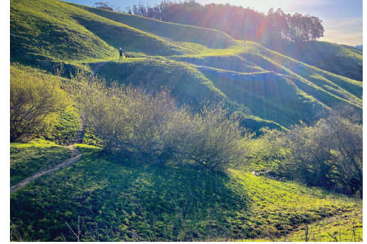
Wildcat Canyon.