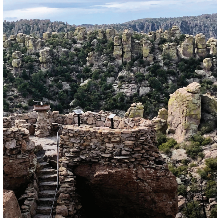
Chiricahua Mountains