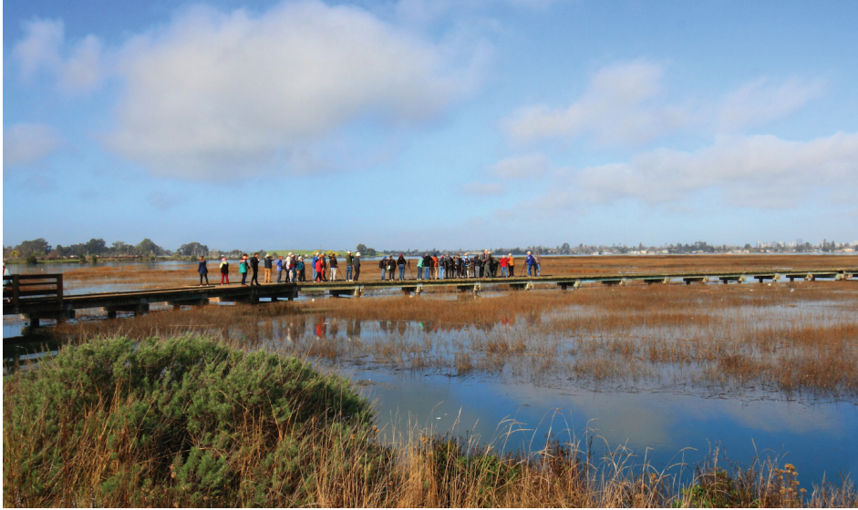
Birders at MLK Jr. Regional Shoreline in Oakland.