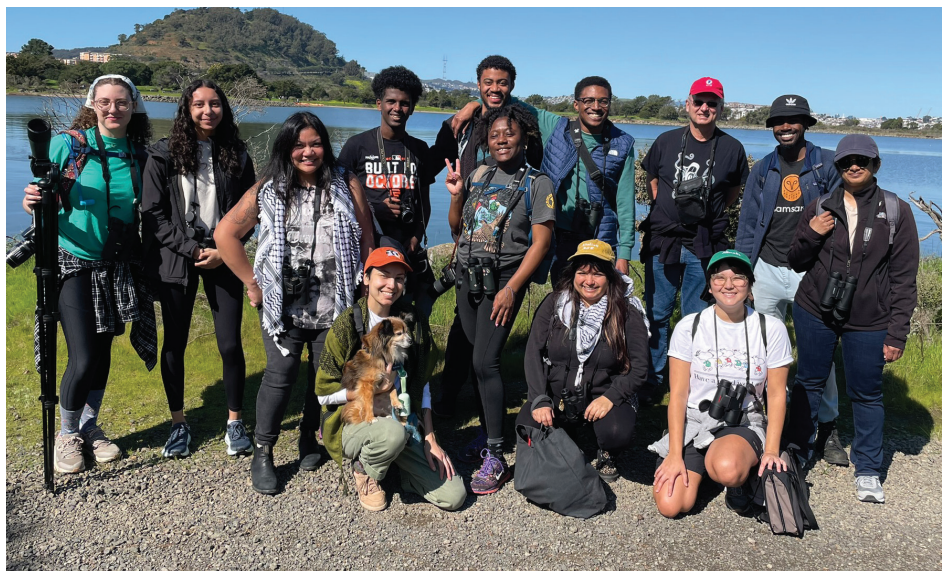
Black History Month Birding Trip.

And these are just two of the fellows from the current cohort.