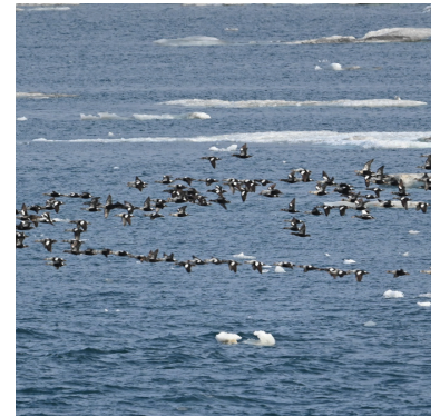
Eiders in the Arctic.

Thursday, May 23 7 p.m. In-Person at the Tamalpais Room (David Brower Center) and Online via Zoom