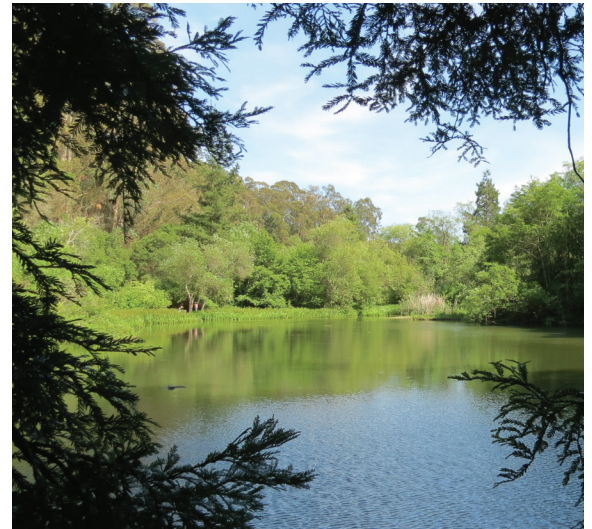
From left: Red-shouldered Hawk ; Jewel Lake