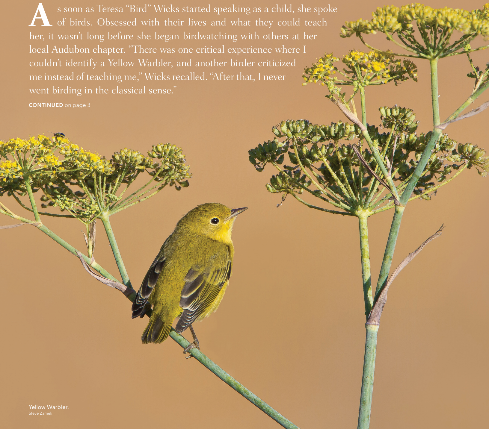
Yellow Warbler. Steve Zamek