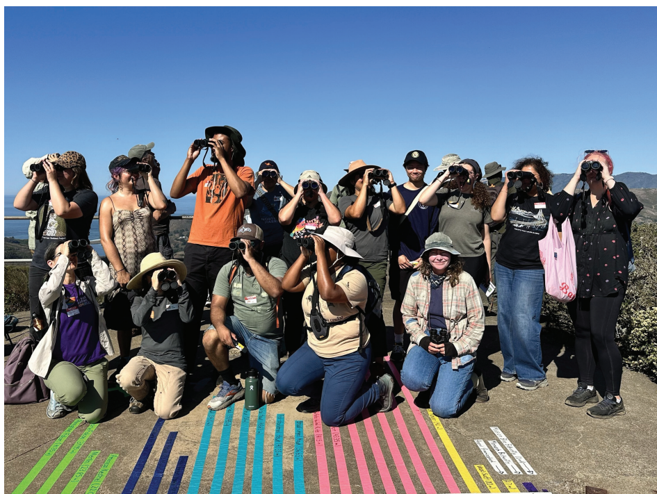
Participants in the Decolonizing Birding Class.

Today, this history can be found through the common names of birds like the Townsend’s Warbler, Scott’s Oriole, and Audubon’ Shearwater, all three of which were named after individuals who