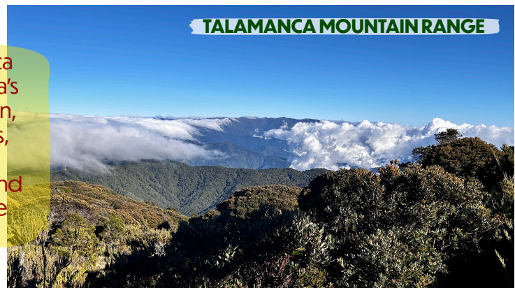
TALAMANCA MOUNTAIN RANGE