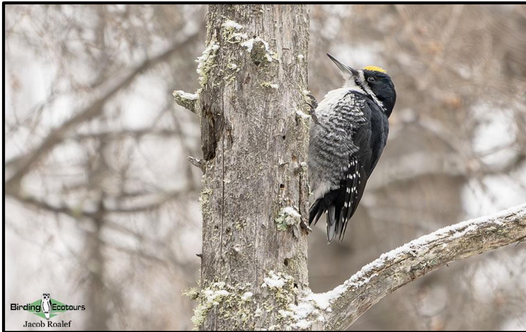
The impressive Black-backed Woodpecker calls the Boreal Forest home.