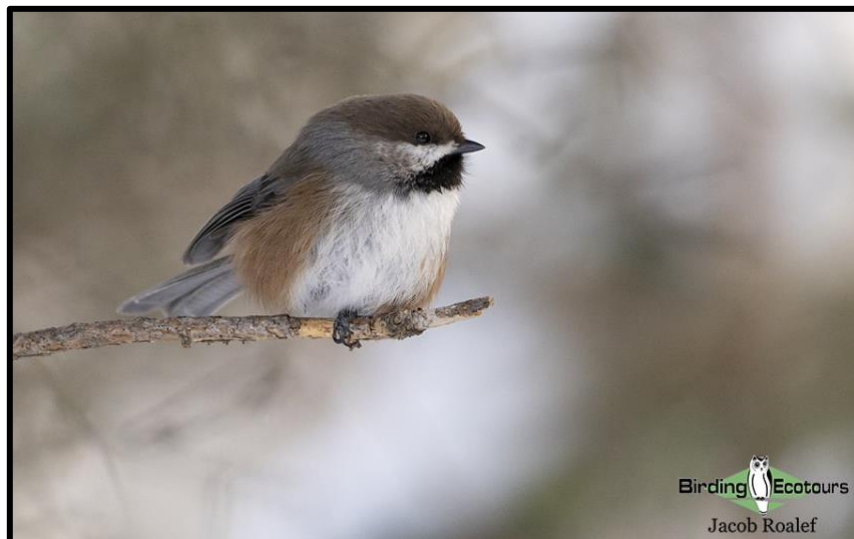
We will search for Boreal

After our final breakfast it will be time to pack out things and make the two and half-hour drive back to Minneapolis to connect with our flights home, thus concluding the tour. We ask that you please book afternoon flights if possible. Depending on flight times, there may be some time for more birding around Minneapolis before departure.