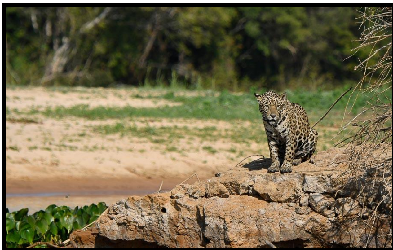
Jaguar is a top target of this fantastic tour.