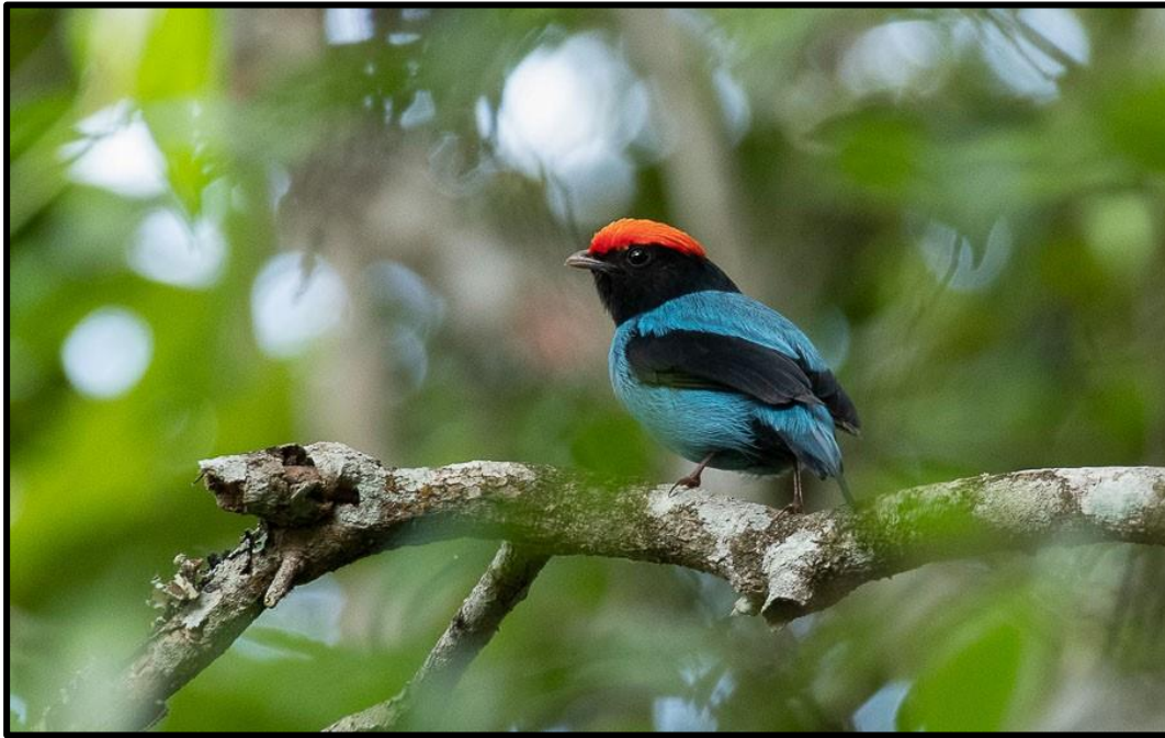
Blue Manakin is another highlight from the Atlantic Forest.