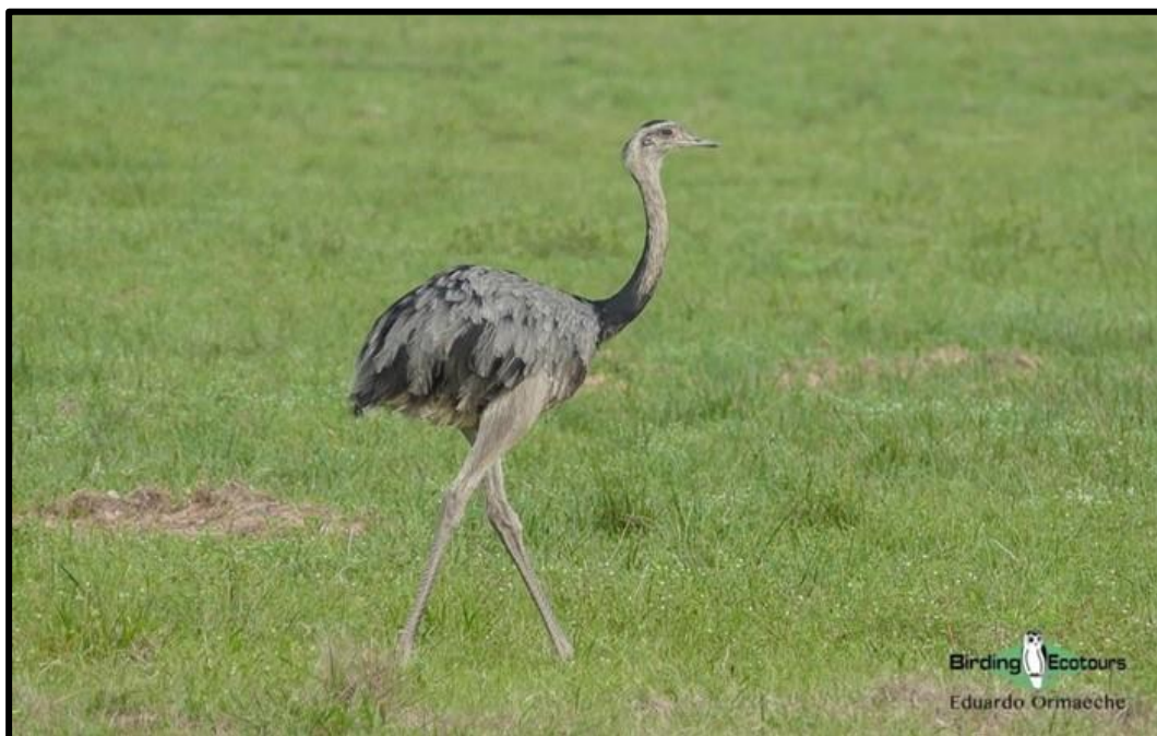
Greater Rhea may be seen along the road to Poconé.