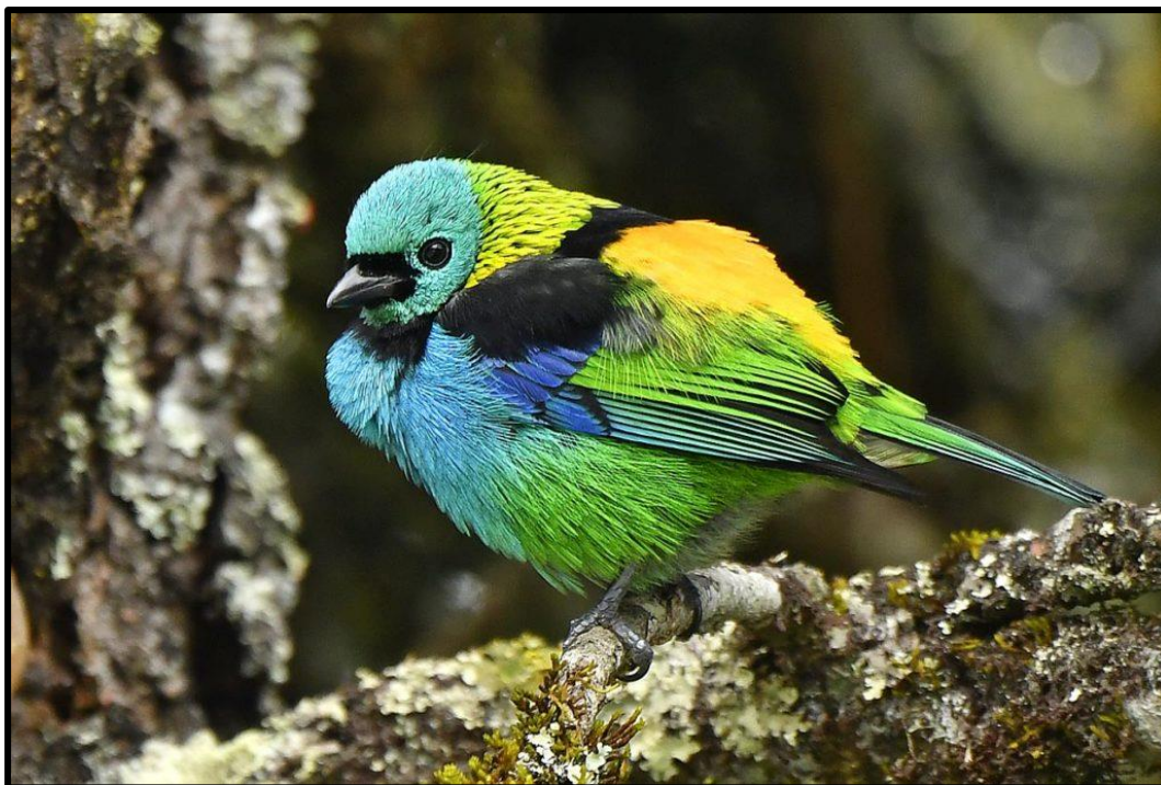
The stunning Green-headed Tanager can be found around Iguazu.