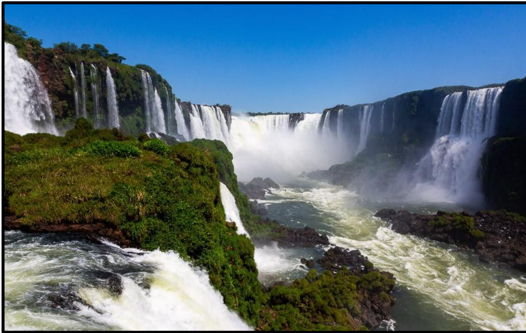
The awe-inspiring Iguazu Falls.

This morning we will head back to Sao Paulo Airport and catch a flight to Foz de Iguazú Airport, in the Brazilian state of Parana. From here we will immediately transfer to Puerto Iguazú on the Argentinean side, in the state of Misiones. Crossing the border is relatively easy, usually taking half an hour by car; the two cities are separated by nine miles (15 km).