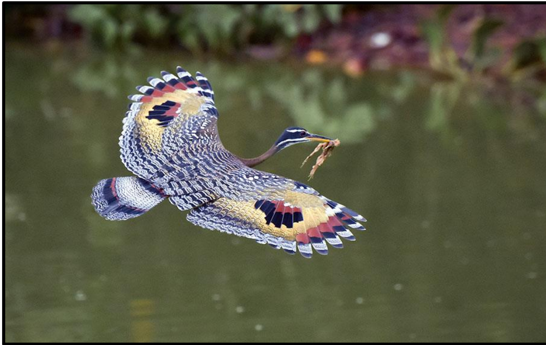
Sunbittern is high on the list of the neotropic's most wanted birds

We will spend the full day exploring Pousada Piuval. Our first activity will be a predawn search for Giant Anteater , if we haven't yet seen it. Later we will explore the expansive areas of this huge property to look for Pale-crested Woodpecker , Greater Thornbird , Chaco Chachalaca , White-throated Piping Guan , Bare-faced Curassow , Picui Ground Dove , Grey-cowled Wood Rail , Sunbittern , Savanna Hawk , Turquoise-fronted Amazon , Red-billed Scythebill , White-lored Spinetail , Orange-backed Troupial , and Greyish Baywing .