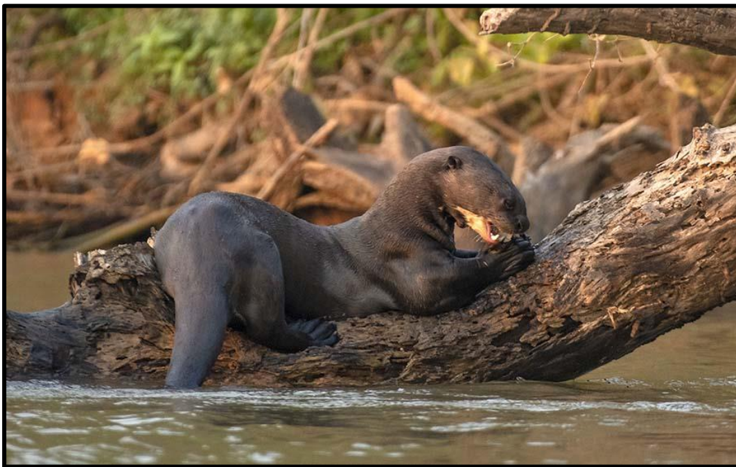
Giant (River) Otter along the Cuiaba River.