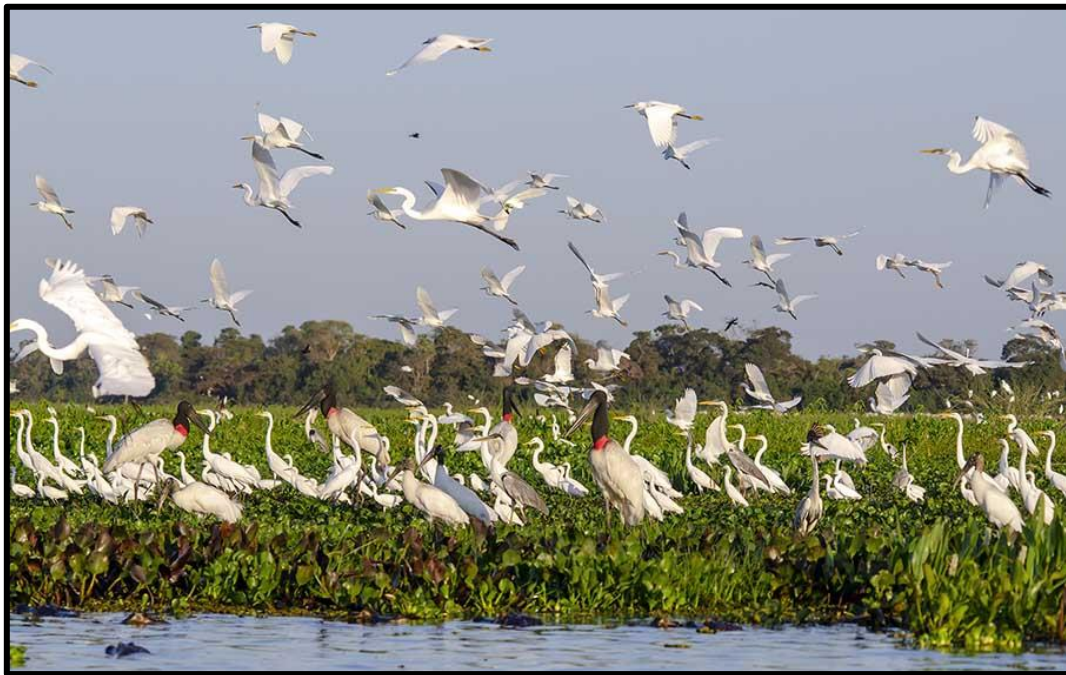
A feast for the eyes in the Pantanal.

During this part of the tour, we will have adequate time to admire the waterfalls and look for the area's special birds. Target species include the impressive Great Dusky Swift , which roost on the waterfall cliffs, Red-rumped Cacique , Toco Toucan , Chestnut-eared Aracari , Blond-crested and Yellow-fronted Woodpeckers , Ochre-collared Piculet , Blue (Swallow-tailed) Manakin , Southern Antpitt , Eared Pygmy Tyrant , Chestnut-bellied Euphonia , Green-headed Tanager , Streak-capped Antwren , Surucua Trogon , Rufous-capped Motmot , Greenish Schiffornis , Rufous Gnateater , Dusky-tailed Antbird , and the most-wanted Black-fronted Piping Guan .