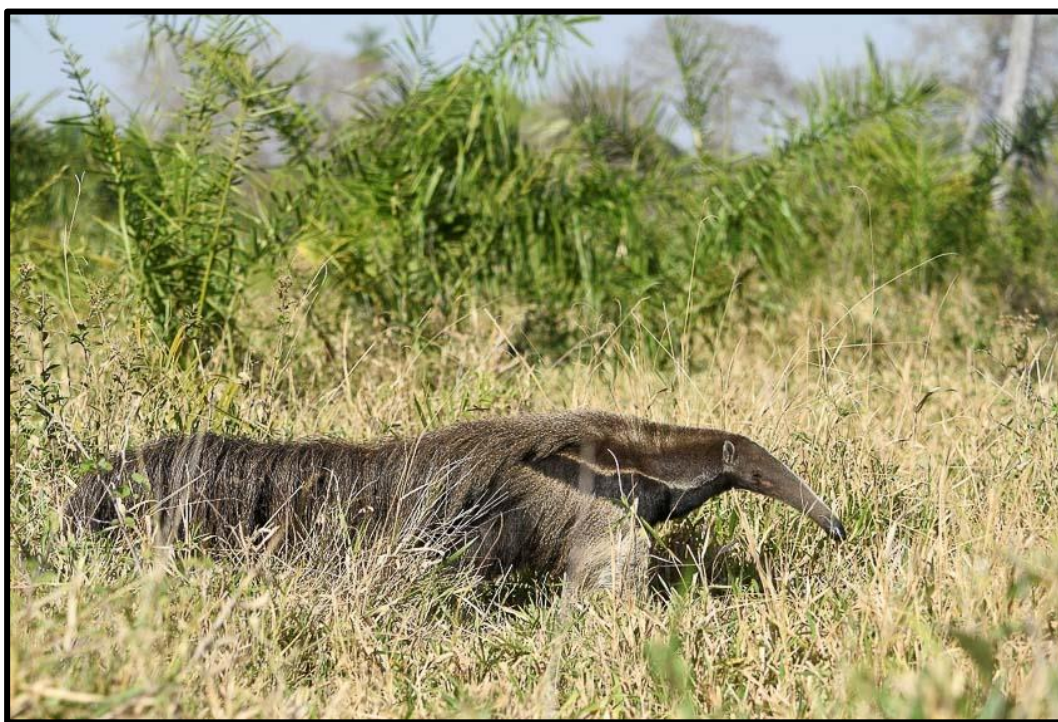
Piuval Lodge is a great place to see Giant Anteater.

In addition to birds, many mammal species call the Pantanal home. It is perhaps South America's greatest wildlife refuge, and we should enjoy daily sightings of Capybara (the largest rodent in the world), primates such as Black-tailed Marmoset , Bearded Capuchin and Black-and-gold Howler Monkeys . With luck, we might encounter Marsh Deer , Crab-eating Raccoon , South American Coati , Yellow Armadillo , Lowland (Brazilian) Tapir and Giant Anteater .