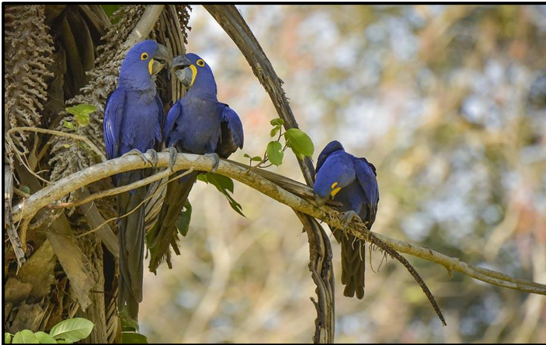
Hyacinth Macaws are always a fan-favorite in the Pantanal.

We will begin our birding and mammal adventure by exploring the Pantanal, a vast, seasonally flooded wetland, renowned for its incredible concentrations of birds at the end of the dry season. We schedule this tour during this particular season, when fish trapped in shrinking pools of water attract hordes of herons, egrets, storks, and other wetland species. The star of these huge concentrations is the massive Jabiru , towering over a diverse collection of smaller South American waterbirds, such as Sunbittern , Plumbeous , Bare-faced , Green , and Buff-necked Ibises , Grey-cowled Wood Rail and Southern Screamer . There is normally a large diversity of raptors around too, with Snail Kite , Black-collared , Savanna and Crane Hawks regularly encountered. Our river trips provide the opportunity to look for species such as Capped Heron , Sungrebe , the striking Agami Heron , Anhinga and a plethora of kingfishers including Green , Amazon , Ringed , American Pygmy and Green-and-rufous Kingfishers . Other target species include Band-tailed Anthbird and, with some luck, the seldom-seen Zigzag Heron . These boat trips also provide the best chances to see Endangered (IUCN) Giant (River) Otters , the largest otter in the world, and one of the 'Big Five' of South American mammals. This is also the best place on the planet for seeing Jaguar — during the dry season sightings are almost guaranteed. This humongous cat shines brightly as the star of the show on this tour.