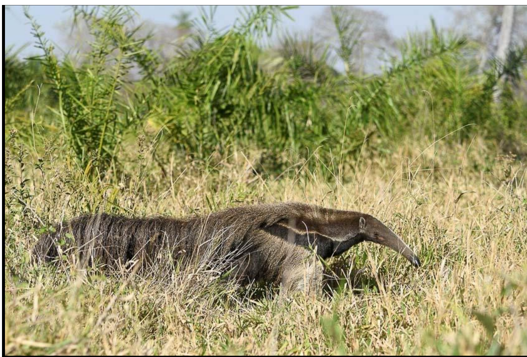
Piuvai Lodge is a great place to see Giant Anteater.

In addition to birds, many mammal species call the Pantanal home. It is perhaps South America's greatest wildlife refuge, and we should enjoy daily sightings of Capybara (the largest rodent in the world), primates such as Black-tailed Marmoset , Bearded Capuchin and Black-and-gold Howler Monkeys . With luck, we might encounter Marsh Deer , Crab-eating Raccoon , South American Coati , Yellow Armadillo , Lowland (Brazilian) Tapir and Giant Anteater .