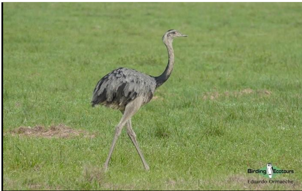
Greater Rhea may be seen along the road to Poconé.