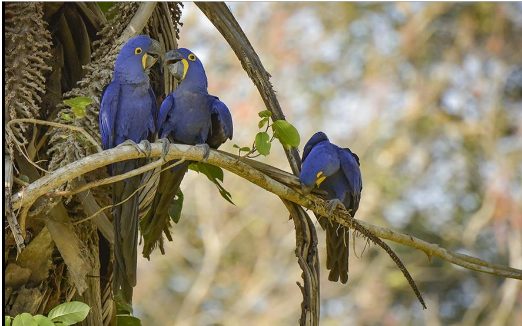
Hyacinth Macaws are always a fan-favorite in the Pantanal.

We will begin our birding and mammal adventure by exploring the Pantanal, a vast, seasonally flooded wetland, renowned for its incredible concentrations of birds at the end of the dry season. We schedule this tour during this particular season, when fish trapped in shrinking pools of water attract hordes of herons, egrets, storks, and other wetland species. The star of these huge concentrations is the massive Jabiru , towering over a diverse collection of smaller South American waterbirds, such as Sunbittern , Plumbeous , Bare-faced , Green , and Buff-necked Ibises , Grey-cowled Wood Rail and Southern Screamer . There is normally a large diversity of raptors around too, with Snail Kite , Black-collared , Savanna and Crane Hawks regularly encountered. Our river trips provide the opportunity to look for species such as Capped Heron , Sungrebe , the striking Agami Heron , Anhinga and a plethora of kingfishers including Green , Amazon , Ringed , American Pygmy and Green-and-rufous Kingfishers . Other target species include Band-tailed Anthbird and, with some luck, the seldom-seen Zigzag Heron . These boat trips also provide the best chances to see Endangered (IUCN) Giant (River) Otters , the largest otter in the world, and one of the 'Big Five' of South American mammals. This is also the best place on the planet for seeing Jaguar — during the dry season sightings are almost guaranteed. This humongous cat shines brightly as the star of the show on this tour.