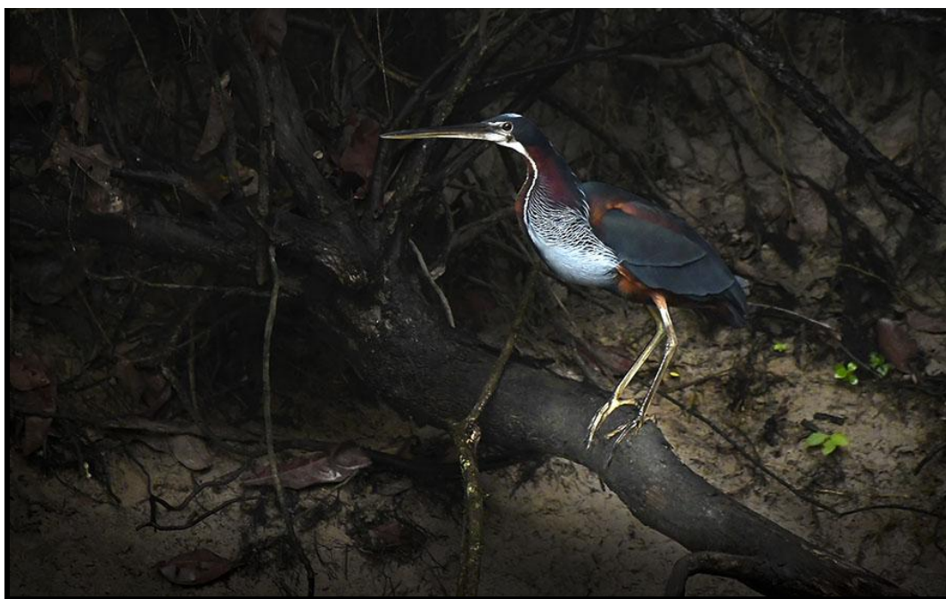
The elusive Agami Heron may be seen in the Pantanal.