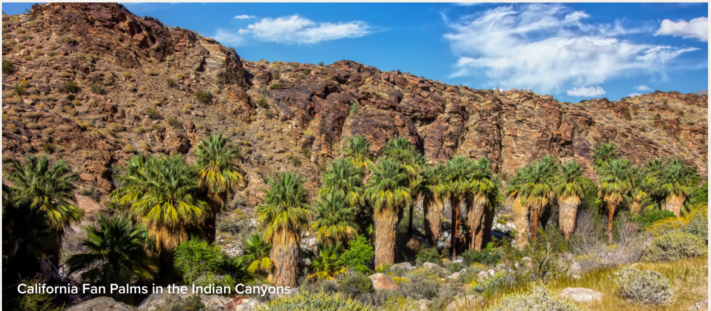
California Fan Palms in the Indian Canyons

Lodging: Best Western Plus Main Street Inn, Brawley