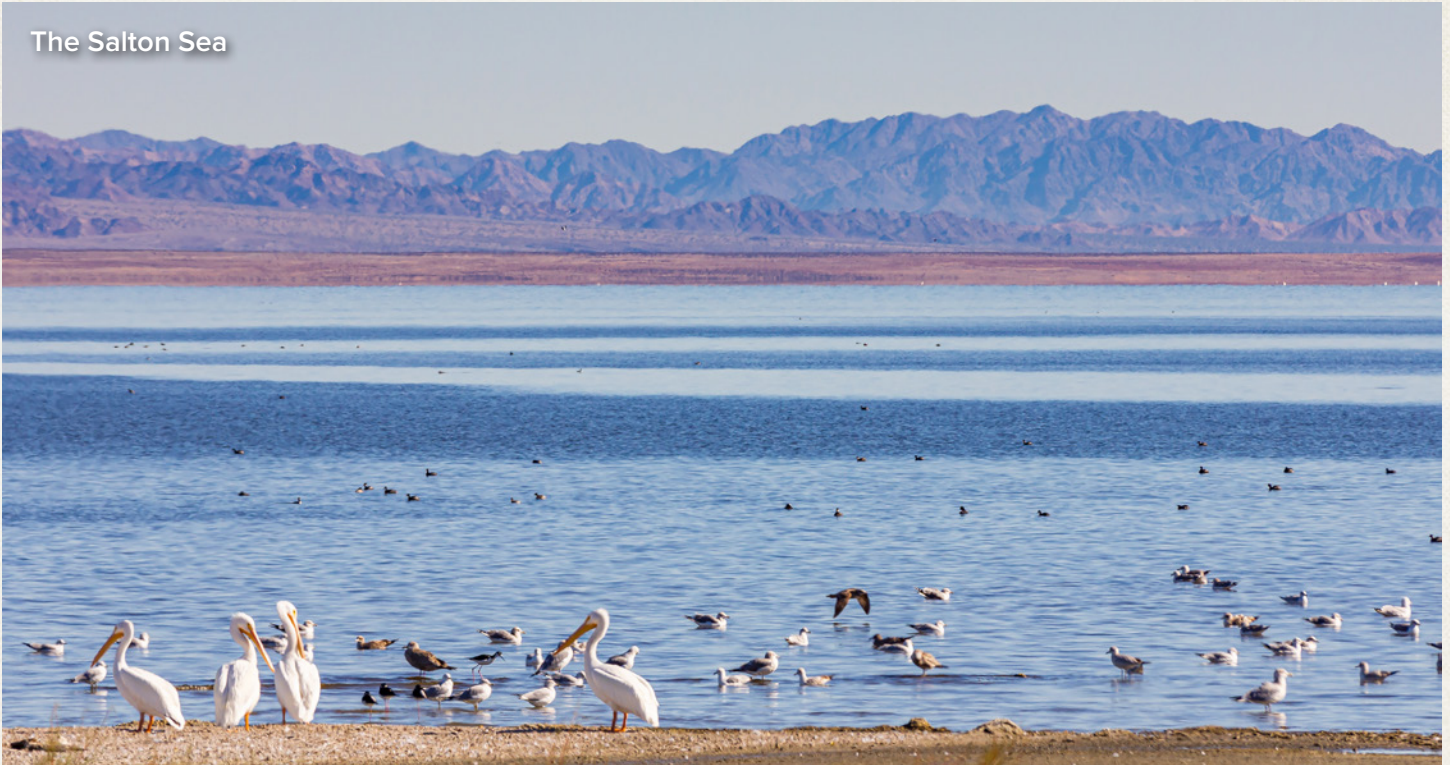
The Salton Sea

few more. Possibilities include Snow Goose , Common Ground Dove , White-faced Ibis , Neotropic Cormorant , Bell's Vireo , and Loggerhead Shrike . We'll make a special effort to find Burrowing Owls , which are fairly common in this area.