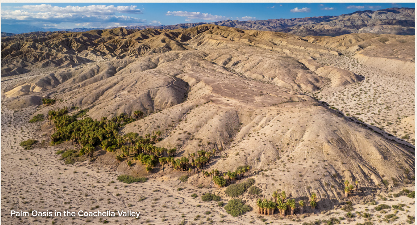
Palm Oasis in the Coachella Valley