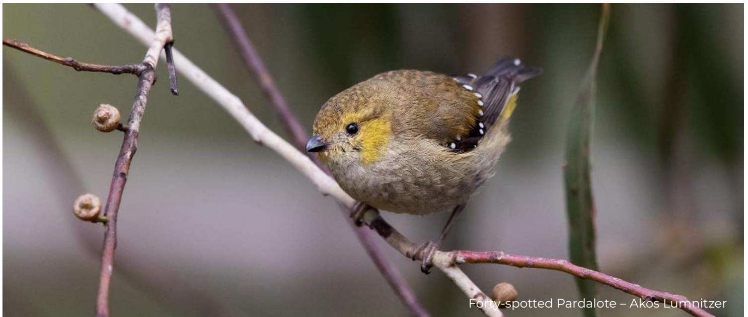
Forty-spotted Pardalote – Akos Lumnitzer

Today we have a full day to explore Bruny Island. We will start the day birding at 'Inala', a privately owned 1,500-acre wildlife sanctuary which is home to all 12 Tasmanian endemic bird species, including one of the largest known colonies of endangered Forty-spotted Pardalote. Strong-billed, Yellow-throated and Black-headed Honeyeaters, Dusky Robin and Green Rosella