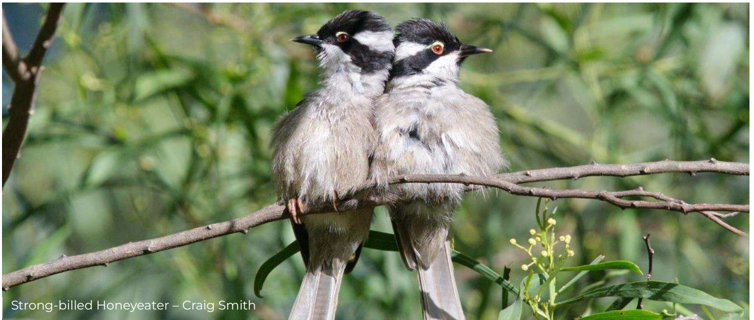
Strong-billed Honeyeater – Craig Smith

Day 10. Friday 5 November 2027. Cradle Mountain to Launceston and depart.