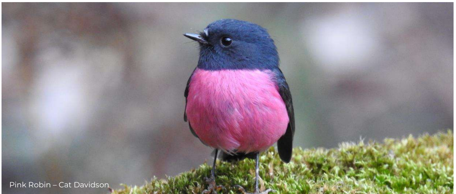
Pink Robin – Cat Davidson

This morning, we will travel north to Cradle Mountain National Park. While today is largely a travel day, we will enjoy wonderfully diverse scenery and stop many times en-route to bird and stretch our legs including at an Alpine Lake with incredible flora and landscape and the possibility of Flame Robin and Striated Fieldwren. If time allows, we shall incorporate a visit to a