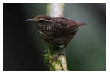
Eye-browed Wren Babbler