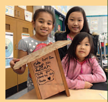
Eco-Ed students

Legacy gifts are an important resource for Golden Gate Audubon. Because we mobilize thousands of volunteers each year, we are able to maximize the impact of each gift. By including Golden Gate Audubon in your