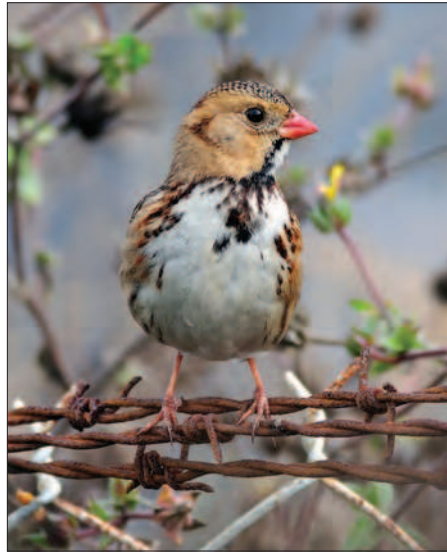
Harris's Sparrow in Hayward.