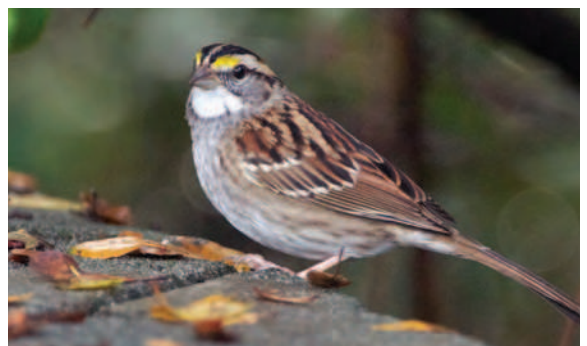
Clockwise from top left: Sausal Creek near Mountain Boulevard, a spot to find Pacific Wren and wintering thrushes; Common Yellowthroat; White-throated Sparrow, an occasional winter visitor.

Have a favorite birding site you'd like to share? Contact idebare@goldengateaudubon.org.