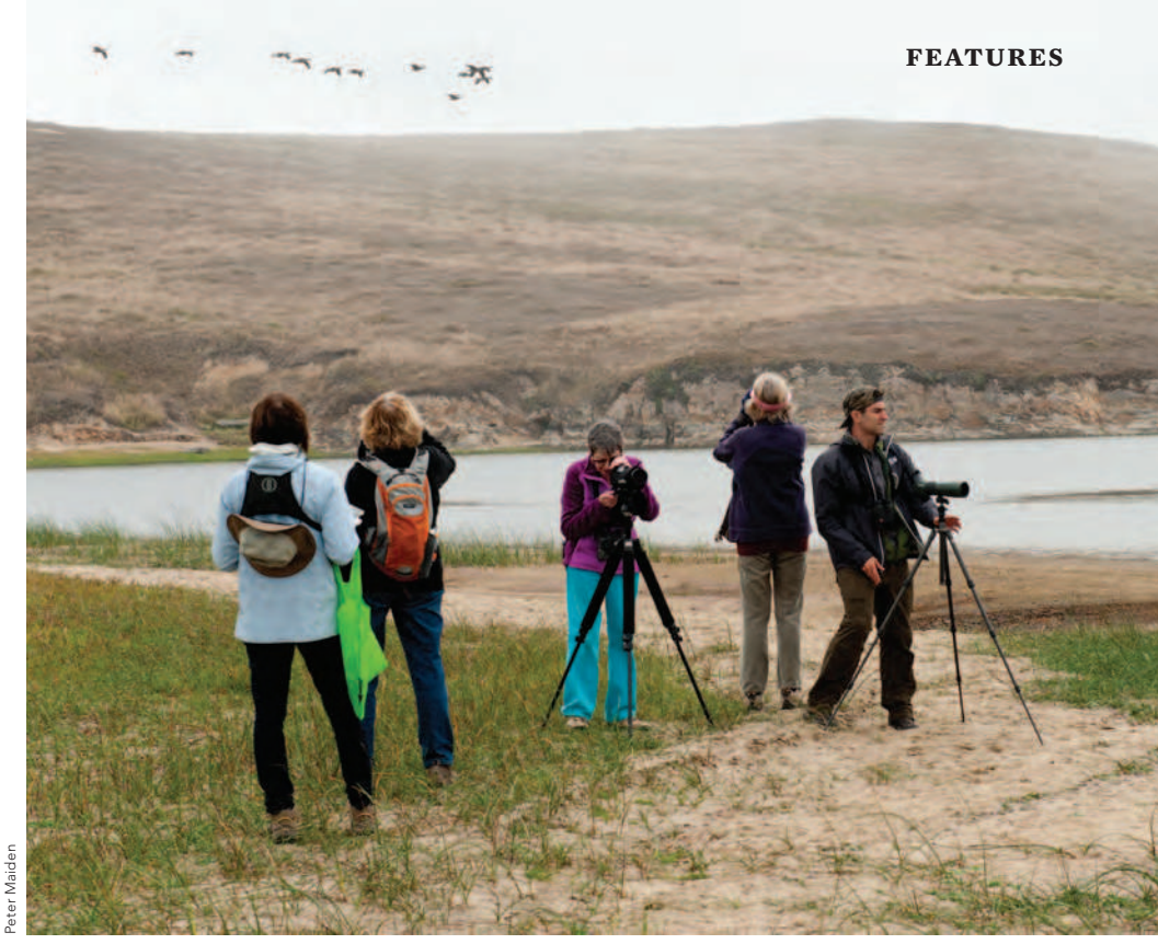
GGAS field trip at the Point Reyes National Seashore