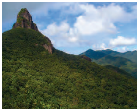
La Mosquitia, a large tract of tropical rainforest.

Berkeley Speaker Series: Northbrae Community Church, 941 The Alameda (between Solano and Marin). Directions: www.northbrae.org/directions.html .