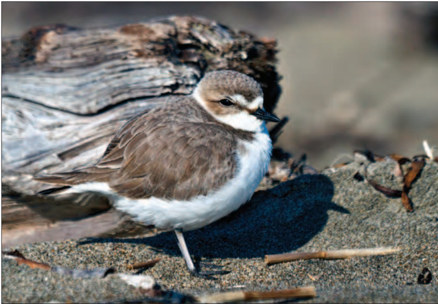
Snowy Plover at the Crissy Field Wildlife Protection Area.