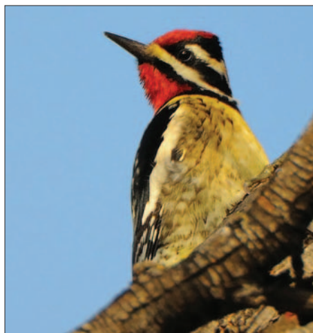
Yellow-bellied Sapsucker in Cupertino, one of seven birds that wintered in the Bay Area.

A White-winged Dove started the New Year at Phipps Country Store in Pescadero, SM (LB, RT). Another joined the Eurasian Collared-Dove flock at Olympic Golf Club, SF,