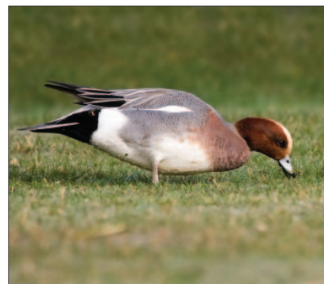
Eurasian Wigeons, including this male photographed in early January, were found in Colma, south of San Francisco, on CBC day.

On a positive note, there may be a relationship between the increase in some raptor species and the removal of mature woodlands. Red-shouldered Hawk numbers increased about 600 percent from 1983–87 until 2005–09, from an average of 8 birds to 49. Red-tailed Hawks are up just over 200 percent during the same period, from an average of 56 to 115. On the other hand,