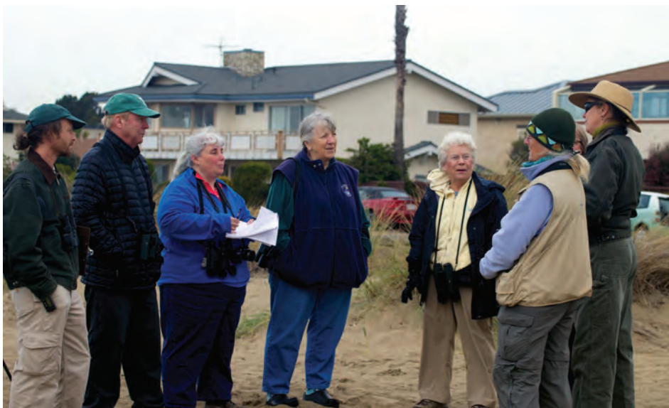
GGAS conservation activists meet with East Bay Regional Park District rangers in Alameda.