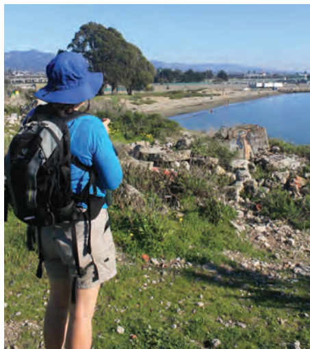
Pam Young looks south at Albany Beach.

A related issue is management of Albany Beach, next to the Bulb. Current park regulations prohibit dogs on the beach, and