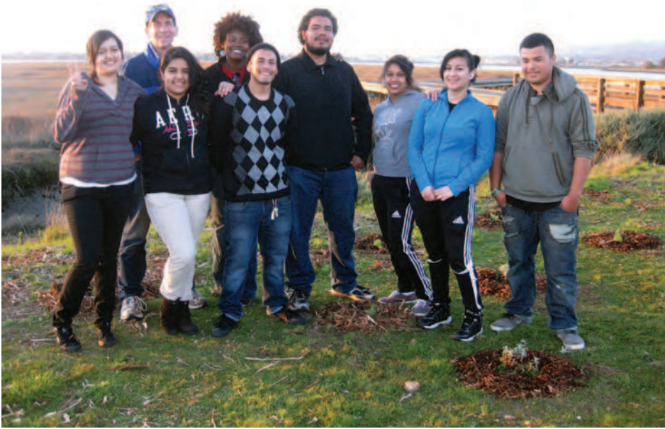
Teens in the new GGAS high school program (a partnership with the East Oakland Boxing Association) visited Arrowhead Marsh and planted upland natives.