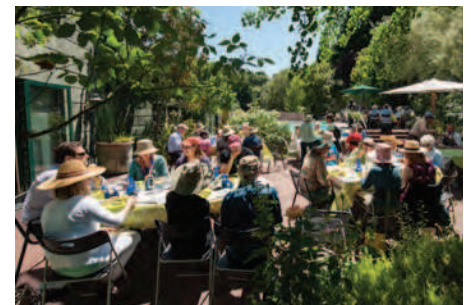
Birdathon awards celebration, held May 19.