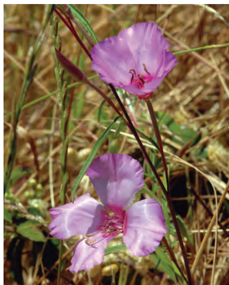
Farewell to spring ( Clarkia amoena ) at Bay View Hill.

Sharp Park. Late in the process, the city inserted a separately planned controversial project at Sharp Park Golf Course that raises a number of environmental red flags. This project severely undermines the integrity of the overall plan and should be removed.