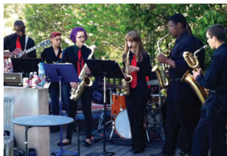
The Skyline High School "jazz-tet" played for attendees.