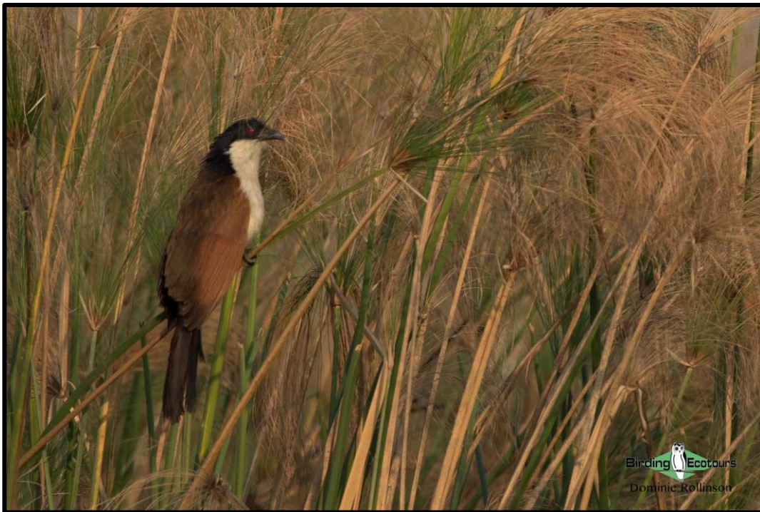
Coppery-tailed Coucal was commonly encountered in papyrus swamps.

Our early-morning birding in the Mahangu area proved to be some of the most productive birding of the entire trip. The riparian vegetation and adjacent floodplain were alive with birds, and we kept pulling ourselves away from one sighting to enjoy the next. Some of the top birds for the morning included Wattled Crane , Coppery-tailed Coucal , Mosque Swallow , Lilac-breasted Roller , Bradfield's Hornbill , Black-collared Barbet , Southern Yellow White-eye , Southern Black Flycatcher , Holub's Golden and Village Weavers , African Reed Warbler , Rattling Cisticola , and Terrestrial Brownbul . During breakfast we had fly-over views of Yellow-billed Stork , Great White Pelican , and Burchell's Sandgrouse . We were also able to scope a small herd of African Buffalos which was feeding on the opposite side of the riverbank.