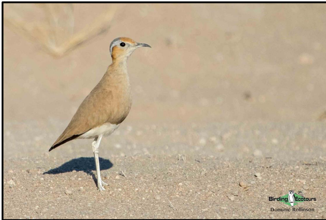
Burchell's Courser was seen a number of times on this trip.

We had lunch at the Okaukuejo waterhole, which was interrupted slightly by a very obliging Pygmy Falcon . Afterwards we did an afternoon drive, which was much quieter but did produce a number of White-backed Vultures feeding on a dead black rhino as well as our first Double-banded Sandgrouse and more Red-crested and Southern Black Korhaans , Kori Bustard , Monteiro's Hornbill , Short-toed Rock Thrush , and Double-banded Courser . We also found a small troop of Banded Mongooses .