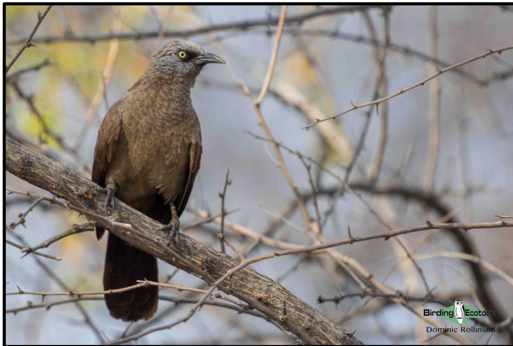
Black-faced Babbler showed well at Mokuti Lodge.

After lunch we continued to Mokuti Lodge, at the eastern edge of the park, where we were based for the next two nights. After checking in we birded the grounds of the lodge, which proved really productive. During an hour's birding we had racked up a bunch of new trip birds, including the likes of White-bellied Sunbird , Meyer's Parrot , Yellow-bellied Greenbul , Yellow-breasted Apalis , Bearded Woodpecker , and our target bird, Black-faced Babbler . The lodge grounds also had dozens of Congo Rope Squirrels and small groups of Banded Mongooses .