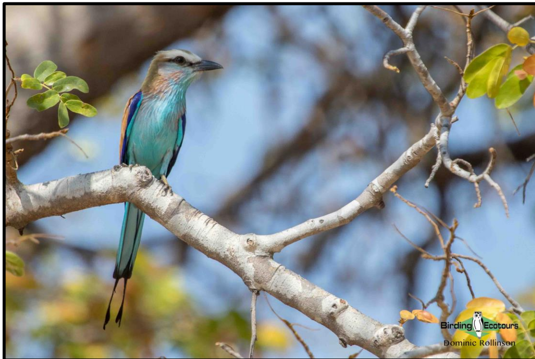
Racket-tailed Roller was seen well in the tall woodlands of the western Caprivi Strip.

We stopped briefly in the tall woodlands west of Divundu to search for Souza's Shrike; unfortunately we did not have any luck with it. However, on our return to the vehicle Cynthia and Hanno had a treat waiting for us in form of a pair of Racket-tailed Rollers – bird of the day for most of the group; well spotted, Cynthia!