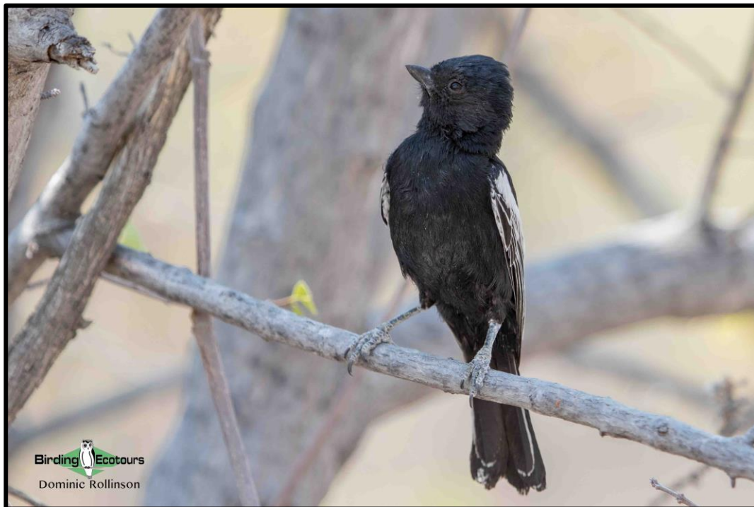
We had fantastic views of Carp's Tit in Etosha National Park.

This custom tour was put together for the Golden Gate Audubon Society and was designed to include a broad diversity of birds (including many Namibian near-endemics) and other wildlife. We traveled from the Namib Desert in the west to the panhandle of the Okavango Delta in the east. As the tour covered a good cross-section of Namibia and Botswana we also took in some truly impressive scenery and amazing African sunsets. We saw 296 species (and an additional four species were heard only) on this 12-day tour, including such highlights as African Pygmy Goose, Hartlaub's Spurfowl, Rüppell's Korhaan, Cape Gannet, White-backed Night Heron, Bank, Crowned, and Cape Cormorants, Ayres's Hawk-Eagle, Wattled and Blue Cranes, Burchell's and Double-banded Coursers, Rock Pratincole, African Skimmer, Burchell's Sandgrouse, Coppery-tailed Coucal, Racket-tailed Roller, Violet Wood Hoopoe, Damara Red-billed, Bradfield's, and Monteiro's Hornbills, Pygmy and Red-necked Falcons, Rüppell's Parrot, Carp's Tit, Gray's, Dune, Stark's, Karoo Long-billed, and Pink-billed Larks, Mosque Swallow, Rockrunner, Bare-cheeked Babbler, Orange River White-eye, and many others.