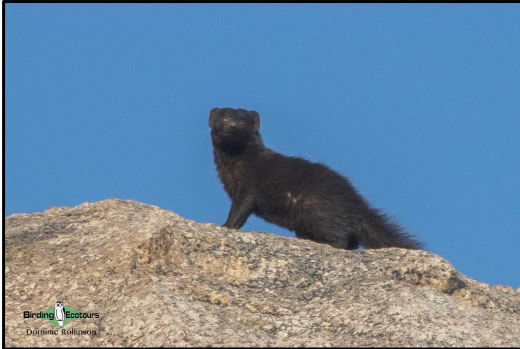
We saw a fairly relaxed pair of Kaokoland Slender Mongooses in the Erongo Mountains.

From Erongo we headed north to Etosha National Park. The drive was relatively uneventful apart from a Brown Snake Eagle and a small flock of Alpine Swifts . We entered the park in the early afternoon, and it didn't take long until we came across large numbers of game such as Black-faced Impala , Springbok , Greater Kudu , Gemsbok , Plains Zebra , Giraffe , and a few families of South African Ground Squirrels . Despite the heat the birding was still good, and we found Marico and Chat Flycatchers , Scaly-feathered Weaver , Tawny Eagle , Common Ostrich , Kori Bustard , Namaqua Sandgrouse , and Southern White-crowned Shrike .