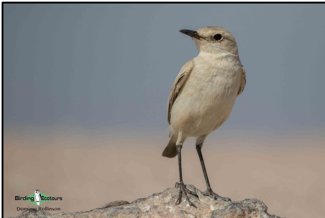
A friendly Tractrac Chat was seen in the Namib Desert near Swakopmund.

After a hearty lunch we birded in the lodge garden, and here we found Orange River White-eye , Namaqua Dove , Dusky Sunbird , and Red-faced Mousebird , while a number of South African Cliff Swallows were seen along the esplanade. Later in the afternoon we took a drive to Rooibank, where we had fantastic views of at least three Dune Larks (Namibia's only endemic bird species) along with our first Pale Chanting Goshawk , Pale-winged Starling , and a few fly-over Grey-backed Sparrow-Larks .