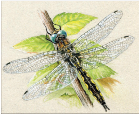
Beaverpond Baskettail