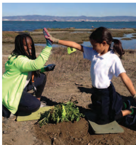
Eco-Education students work together to plant native flora at Pier 94.

Martin Luther King Jr. Regional Shoreline (Oakland). GGAS works in cooperation with East Bay Regional Park District, the land management agency here, to remove trash and weeds and plant native plants. The area serves as an outdoor classroom for our Oakland Eco-Education students. This spot is particularly meaningful to GGAS since we fought to protect this estuarine shoreline for decades. Today it hosts a rich assortment of shorebirds, ducks, waders,