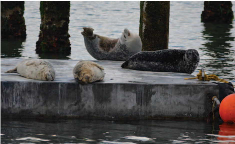
Harbor seals rest on the new float suggested by Golden Gate Audubon.