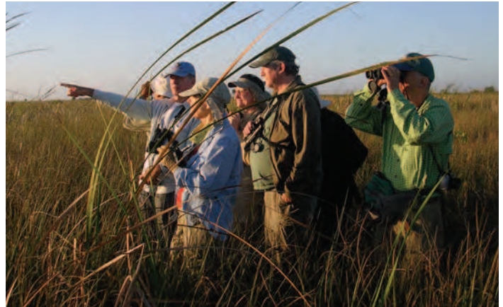
Birding in Cuba.

“Most importantly,” she said, “we look for vendors who employ talented, professional ornithologists who know their stuff—guides who have done all the legwork of bird sightings and ID and, where possible, live and work in the region they are guiding.”