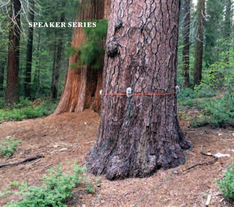
"Tree ears" recording technique in Yosemite