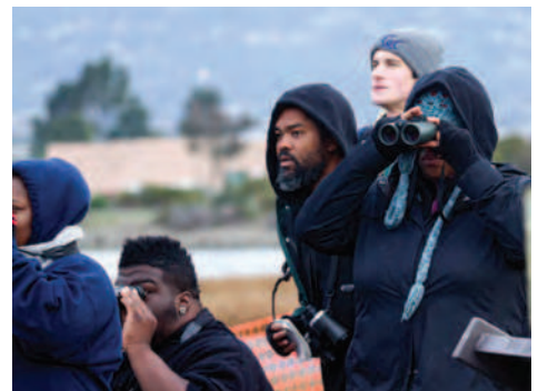
(From left) The 2016 CBC in San Francisco, and lunch break at Lake Temescal in Oakland. Counting at Martin Luther King Jr. Shoreline in Oakland.