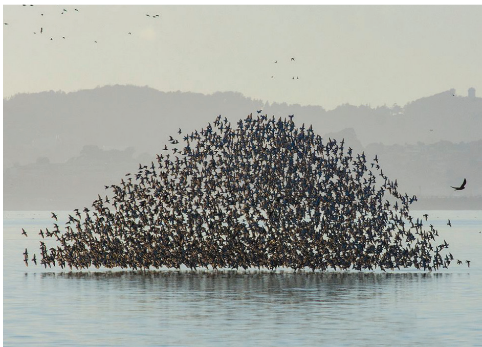
Sandpipers at Elsie Roemer.