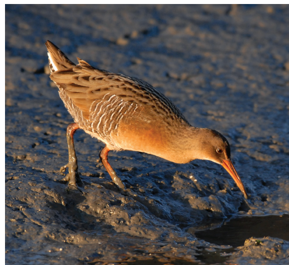
(From left) Damon Slough at MLK Shoreline ; Ridgway's Rail.

Even the ubiquitous Canada geese are joined by the Snow Goose, Cackling Goose, and Greater-white Fronted Goose species on the landscaped turf areas. Check eBird to see recent sightings and enjoy a wonderful walk!