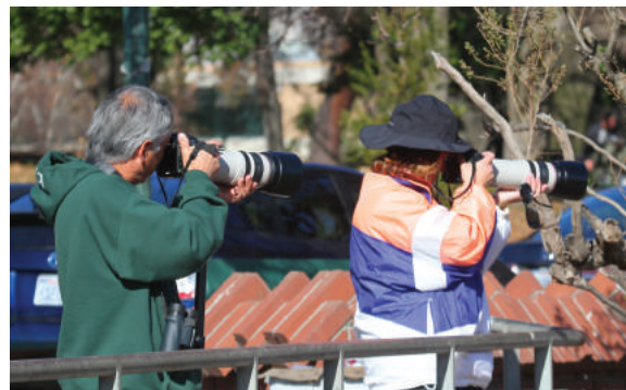
(From left) Scenes from Lake Merritt: Lake Chalet, Tufted Duck and Greater Scaup, and birders.