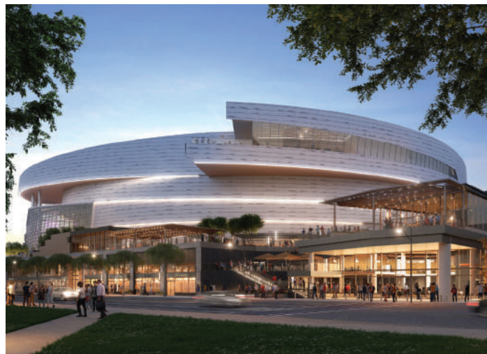
Photo courtesy of Warriors Chase Stadium.

The result is an 18,000-seat arena and event space that has a US Green Building Council Leadership in Energy and Environmental