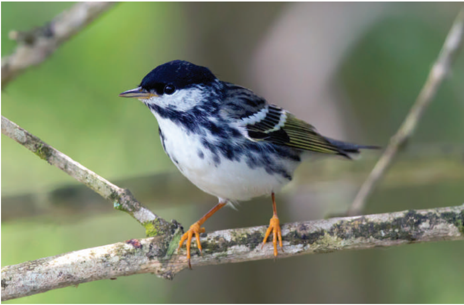
Male Blackpoll Warbler.