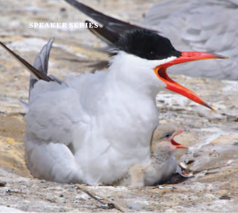
Caspian Tern and chick.