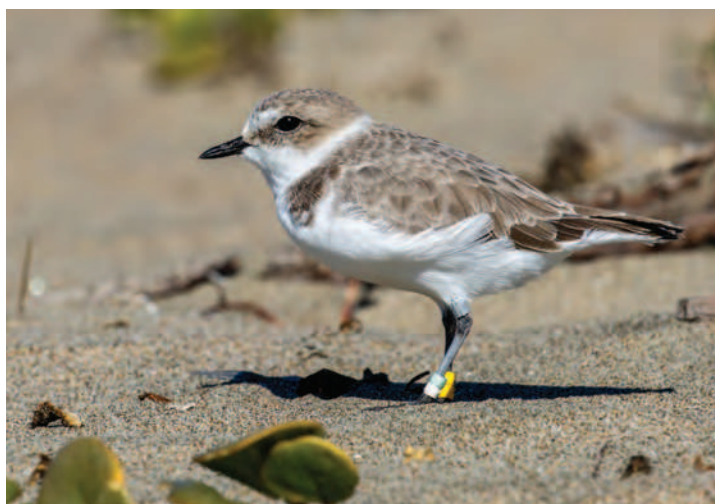
From left: GGAS volunteers restore Presidio habitat in the early 2000s; this Snowy Plover was rescued and banded after the Cosco Busan oil spill in 2008, then spotted at Crissy Field in 2015.