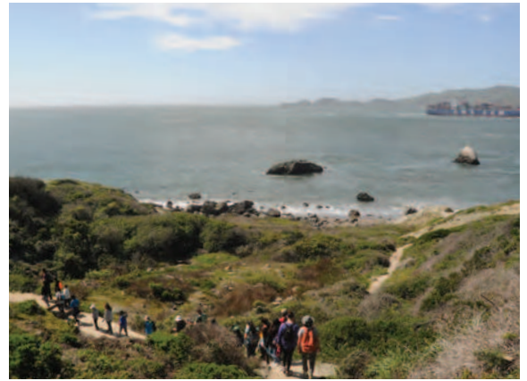
(From left) Elegant Terns at Crissy Field; hiking the Batteries to Bluffs trail.