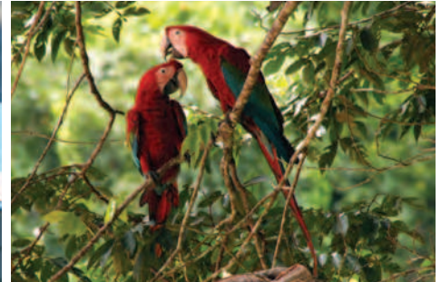
(From left) Alaska Range ; grey whale encounter in Baja ; Scarlet Macaws in Peru.