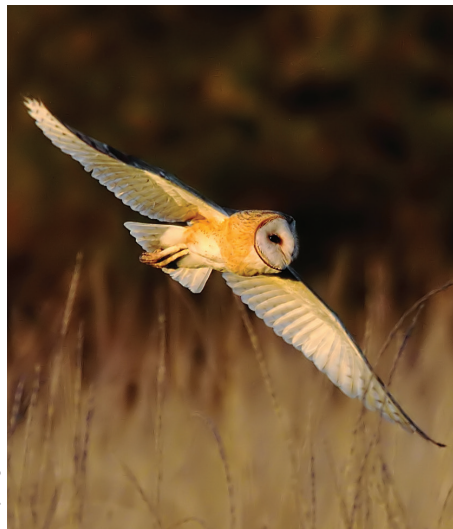
Barn Owl in flight.