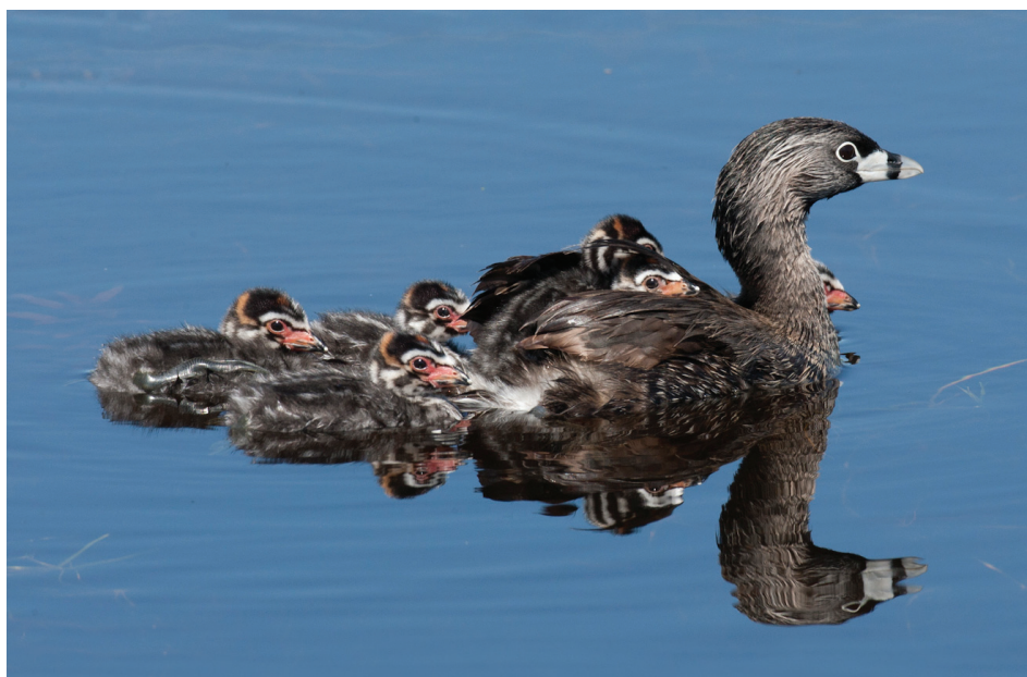
Pied Billed Grebe with youngsters.