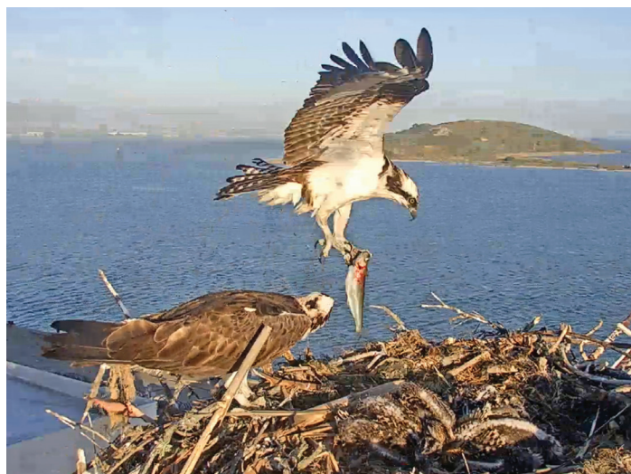
Osprey Richmond delivering a small Jacksmelt to the family.

Non-disruptive wildlife observations of this type contribute to scientific understanding of distribution of resources and important insights about species survival. Additionally, the increased understanding of our Ospreys and their habits can aid in developing human behaviors to protect these birds and other Bay wildlife. For example, the Ospreys' youngest nestling (named Brisa by the GGAS community) became entangled in a wad of ribbon attached to plastic brought in by a parent last season, threatening her ability to move about in the nest and to fledge. For the Live Chat community,