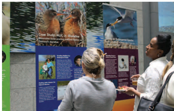
Visitors view the Centennial exhibit in San Francisco.