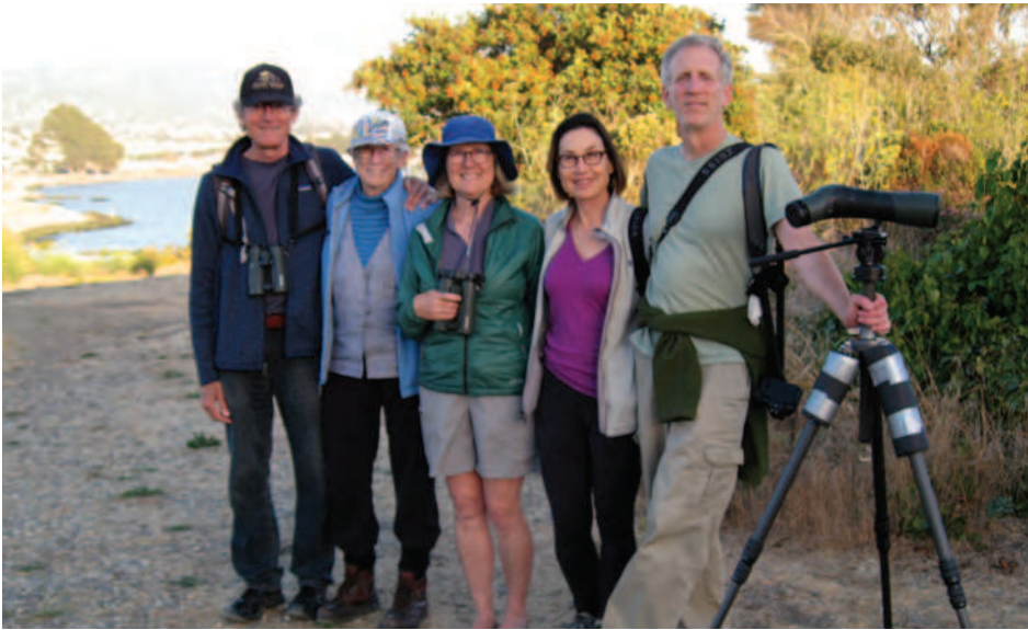
Some members of the Albany shoreline bird survey team.