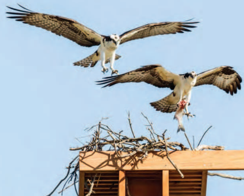
Osprey pair at nest platform.