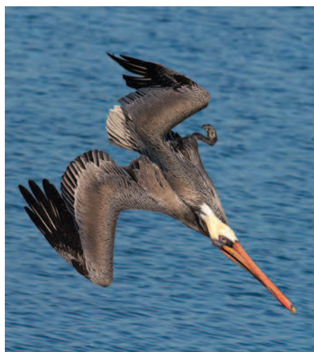
Brown Pelican diving.

Alameda's Breakwater Island roost faced an uncertain future with the decommissioning of the naval base. But GGAS used