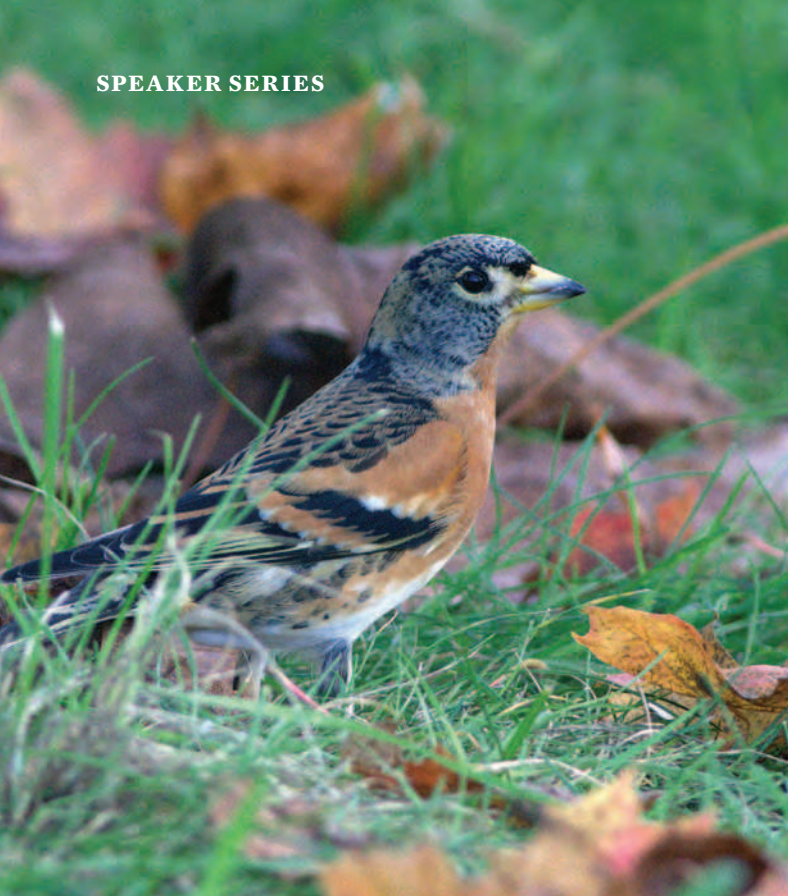
Immature male Brambling.