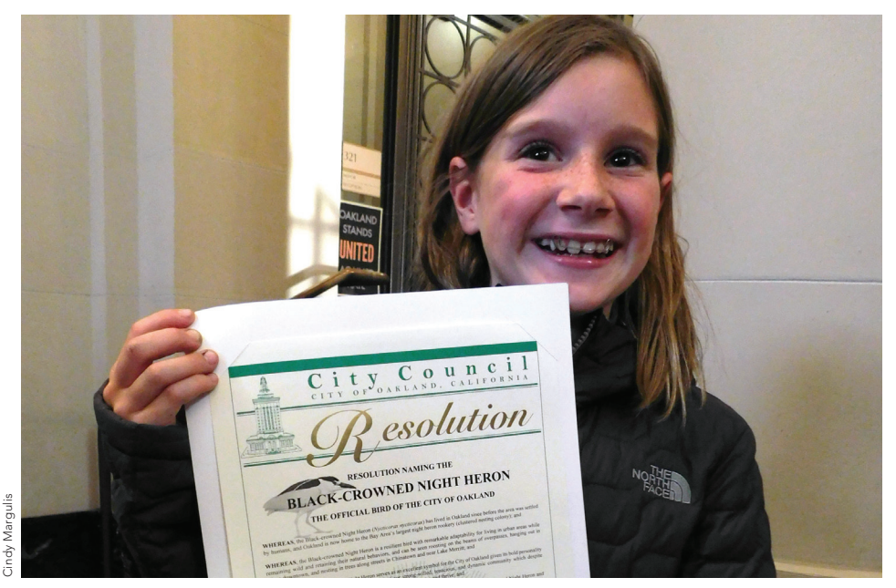
An excited student celebrates the City Council's resolution.